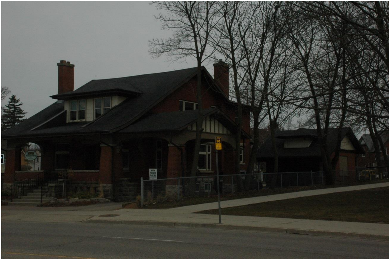
Figure 3: Front and side elevation of 181 Frederick Street

There are no alterations proposed to the existing house and the building will remain preserved in-situ, and the HIA has concluded that the existing house and the garage should be designated under Part IV of the Ontario Heritage Act (Fig. 3). Heritage Planning Staff are generally in agreement with this conclusion. The Statement of Significance for 181 Frederick Street has been revised to include the conclusions and findings of the HIA (Attachment A).