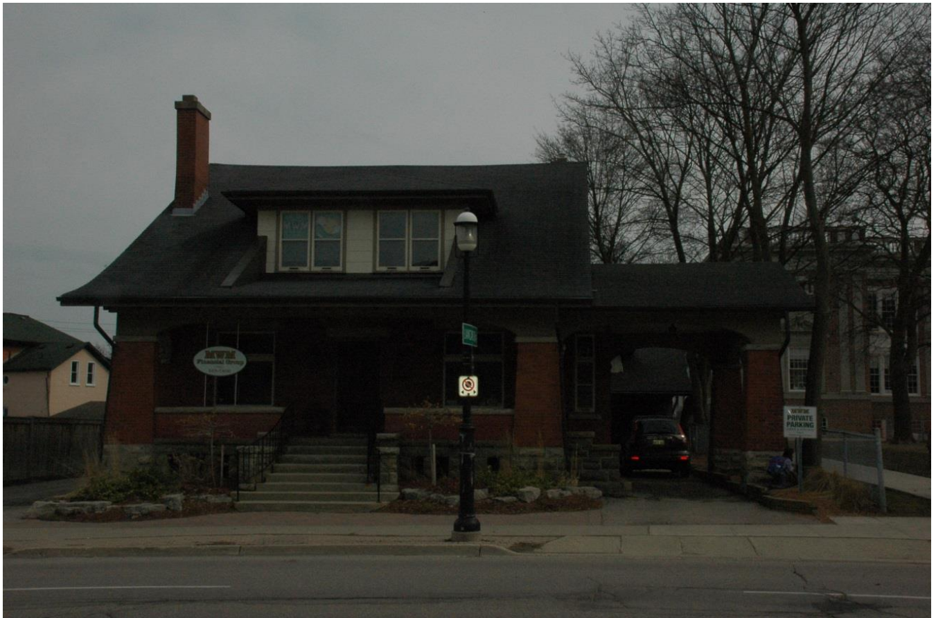
Figure 2: Front Façade of 181 Frederick Street.

The property municipally addressed as 181 Frederick Street is recognized for its design, associative, and contextual values. The house is a one-and-a-half storey unique example of a Craftsman architectural style (Fig 2).