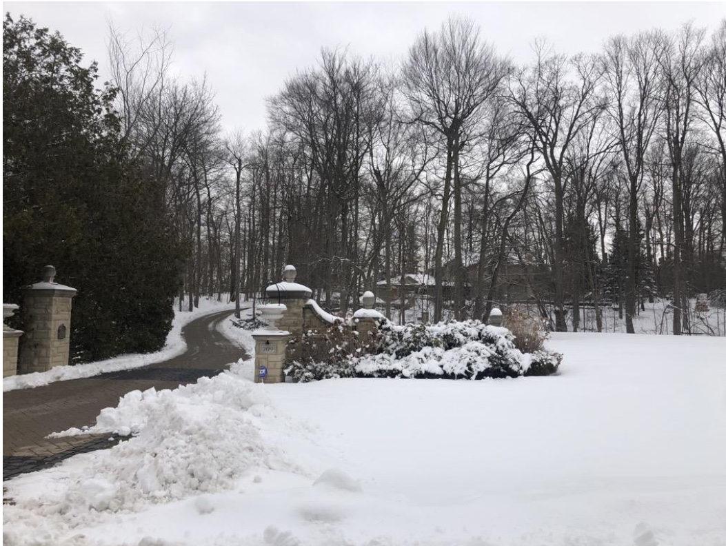
Figure 3 – Photo of Subject Property