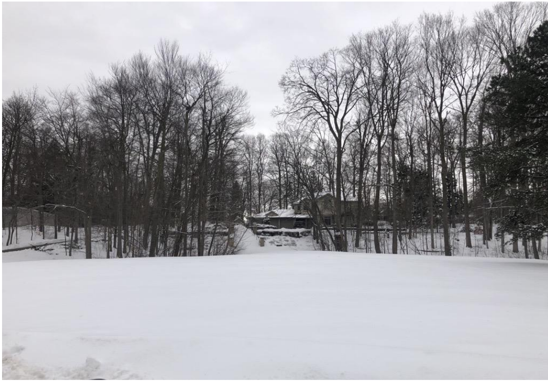
Figure 2 – Photo of Subject Property