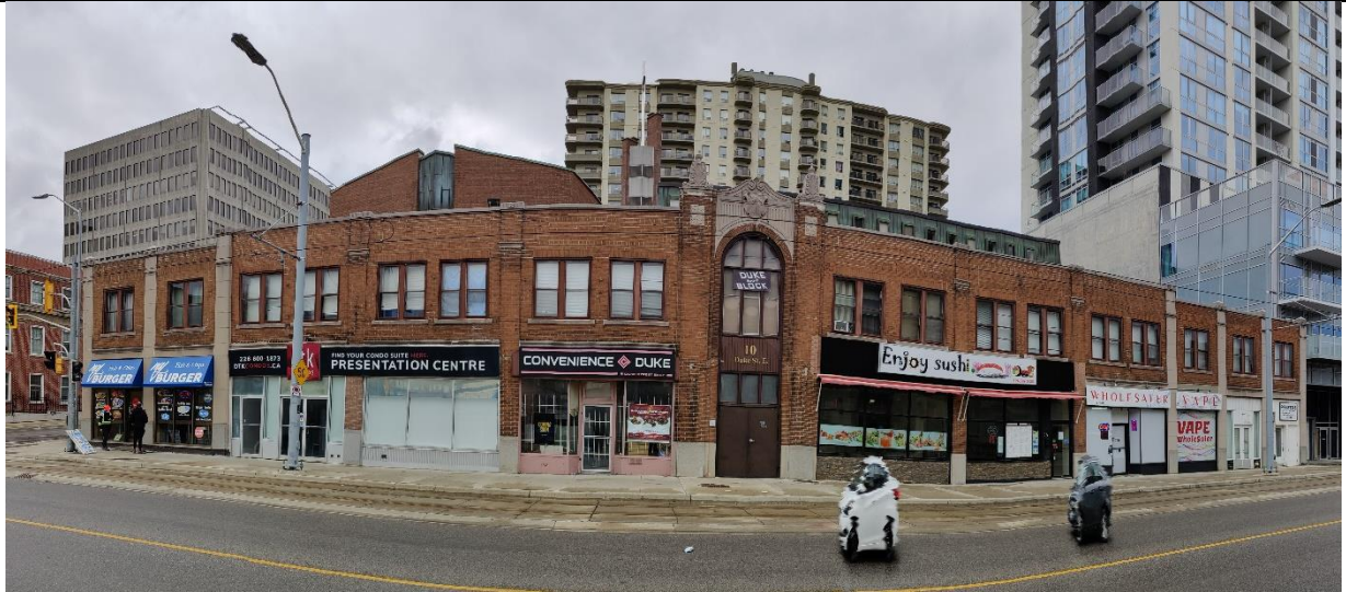
Front Elevation (South Façade)