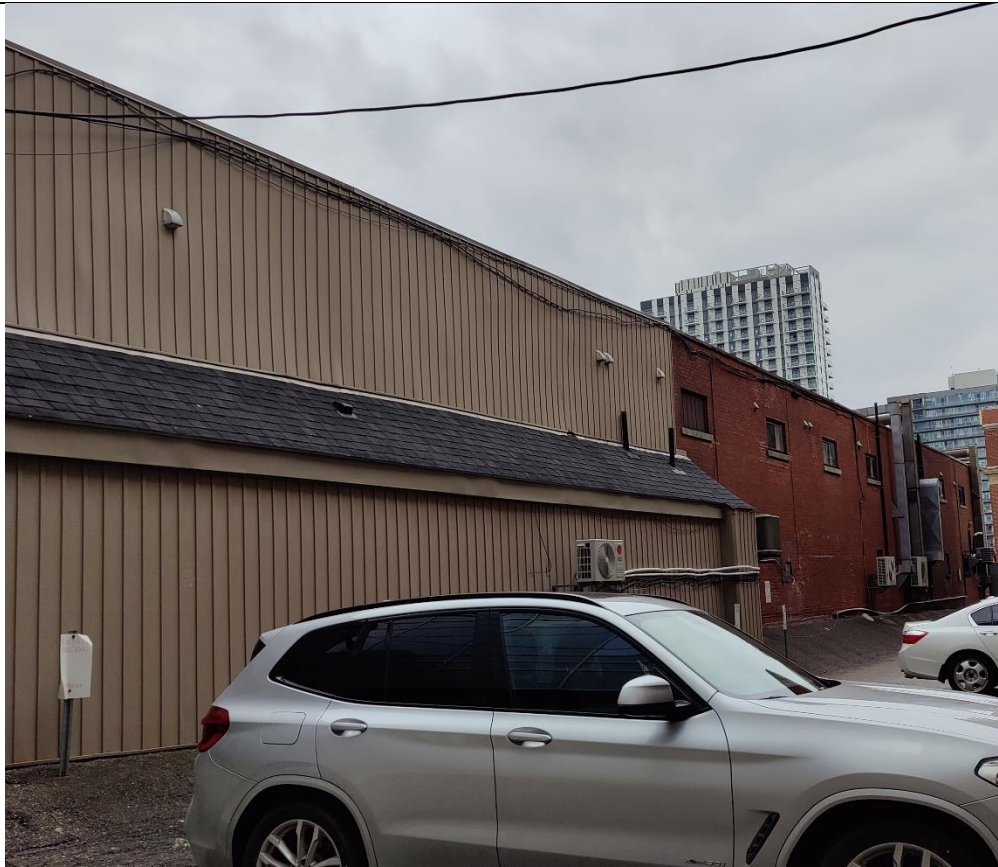
Rear Elevation (North Façade)