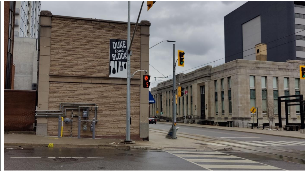
Side Elevation (West Façade)