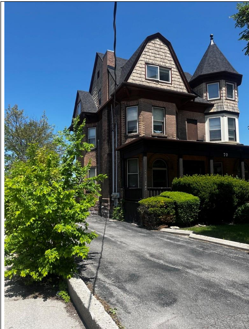
Side Elevation (West Façade)