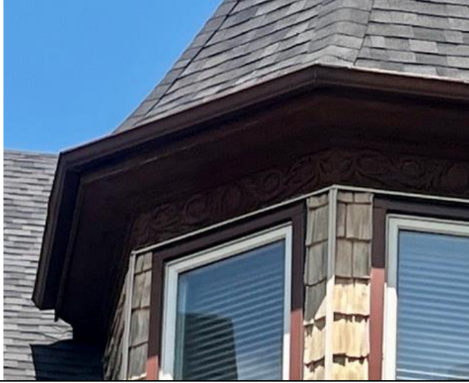
Decorative Frieze on Tower