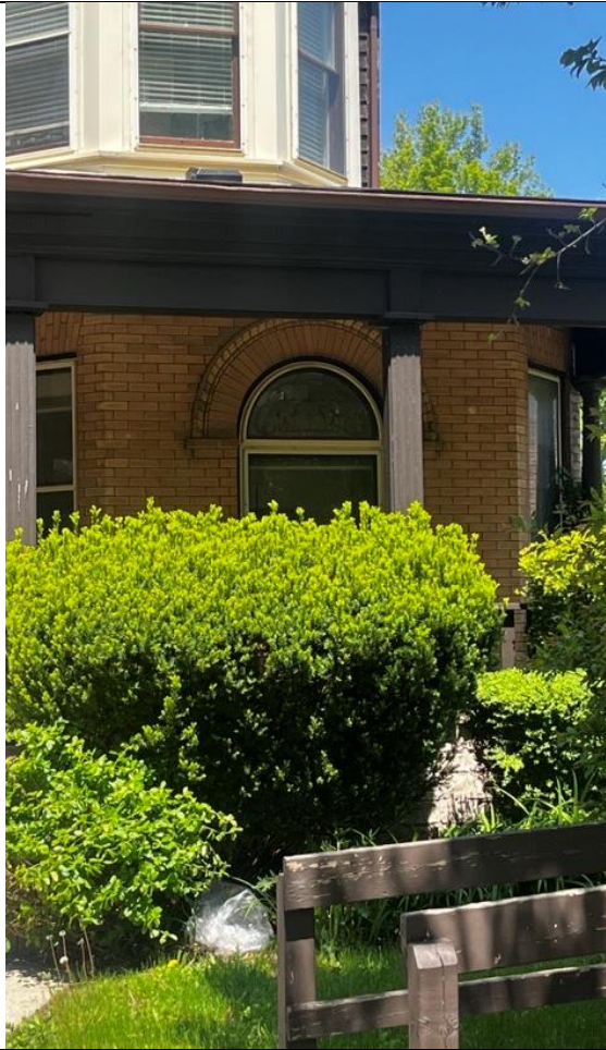
First floor window with stained-glass half-round transom and voussoir