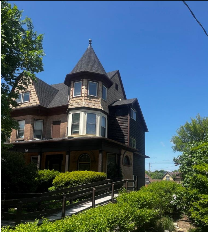
Side Elevation (East Façade)