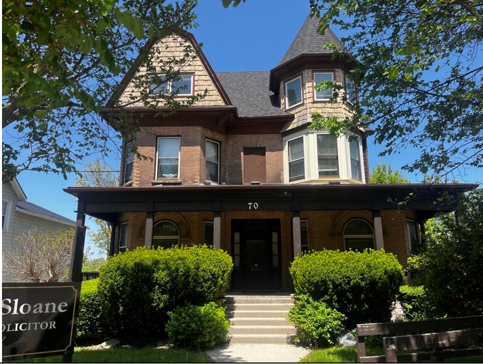
Front Elevation (South Façade)