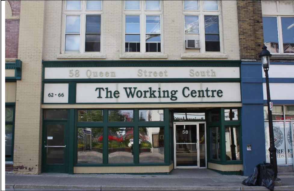
58 Queen Street South