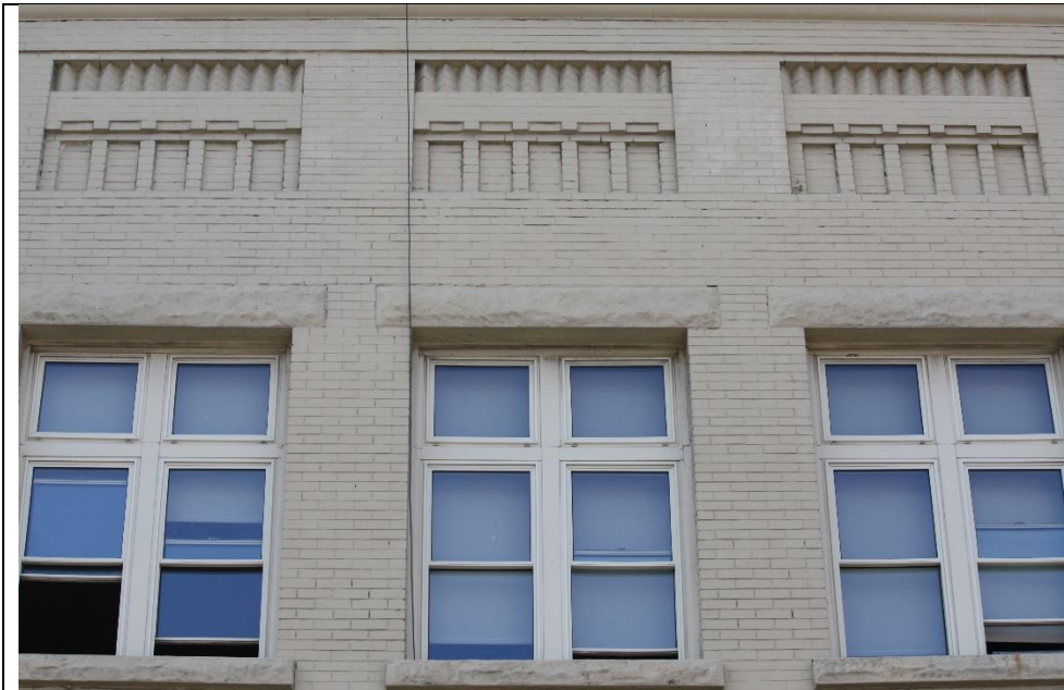
58 Queen Street South