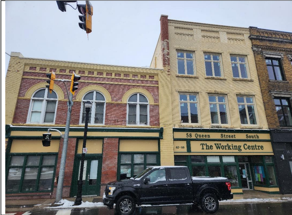
58 Queen Street South – Front (East) Façade