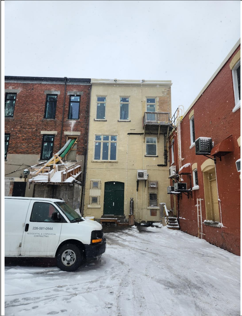
58 Queen Street South – West (rear) façade