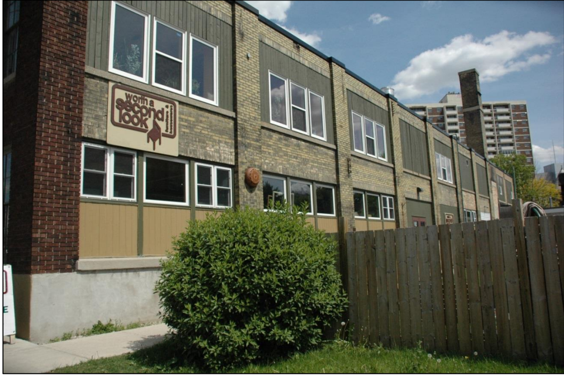
97 Victoria Street North