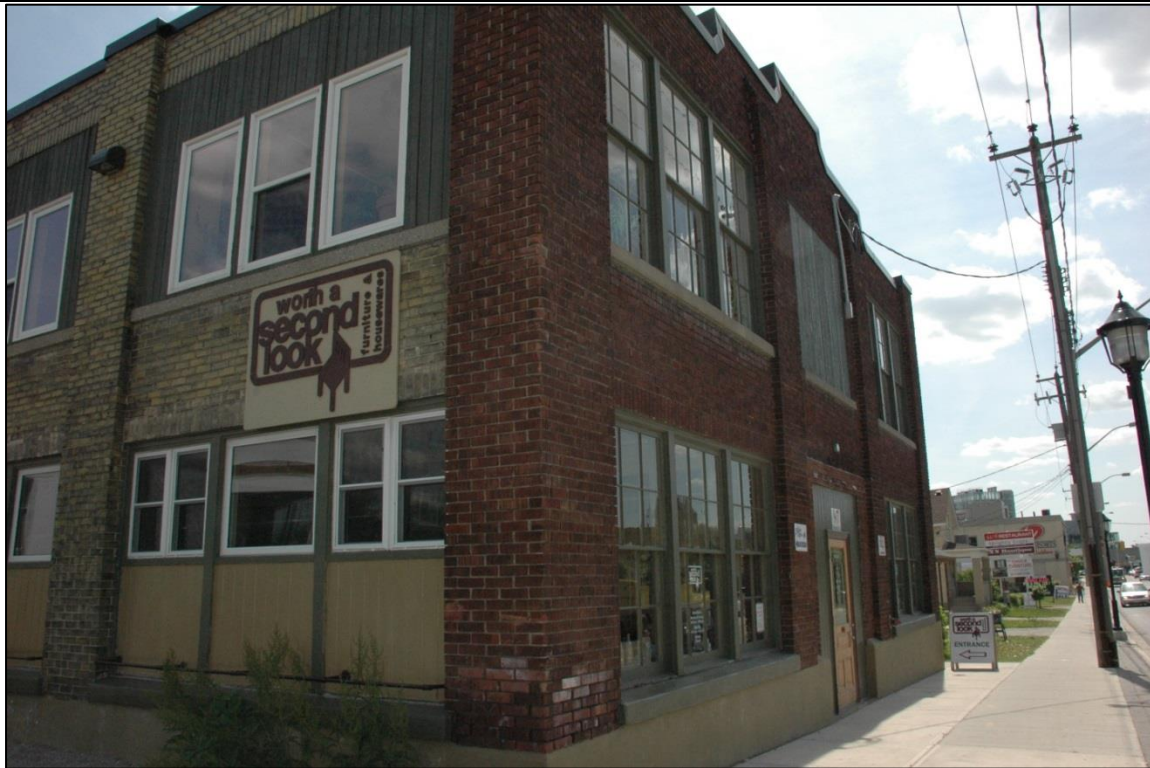
97 Victoria Street North – Front and side façade

Daub, B. (2022) Heritage Impact Assessment – 97 Victoria Street North, Kingston, ON