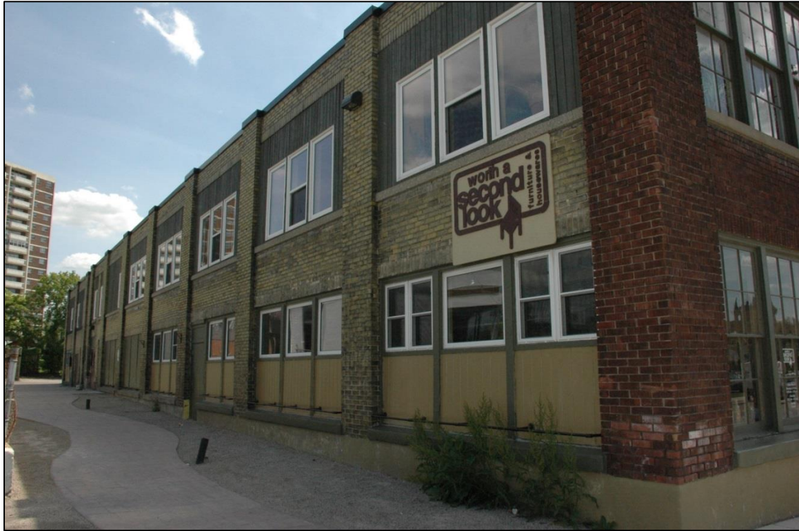
97 Victoria Street North