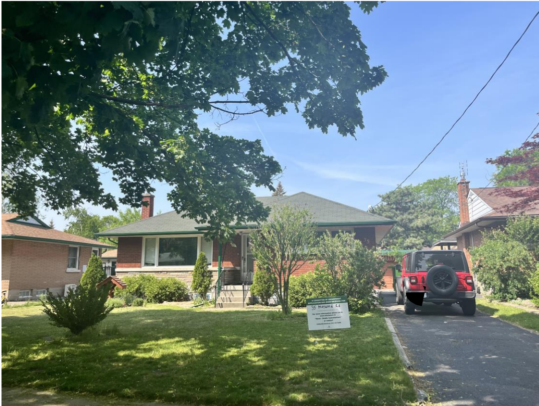
Figure 4 – Front View Photo from Site Visit