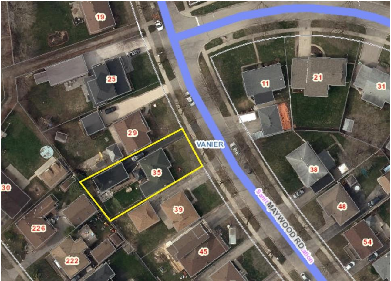
Figure 1 – Ariel Photo of Subject Property

The rear yard and left side yard setbacks of the existing garage exceed the 0.6 metre minimum requirement stated in Zoning by-law 2019-051 Section 4.12.3 j), as the setbacks are 3.90 metres and 0.69 metres, respectively. The proposed asphalt walkway meets the minimum width of 1.1 metres stated in Zoning by-law 2019-051 Section 4.12.3 n).