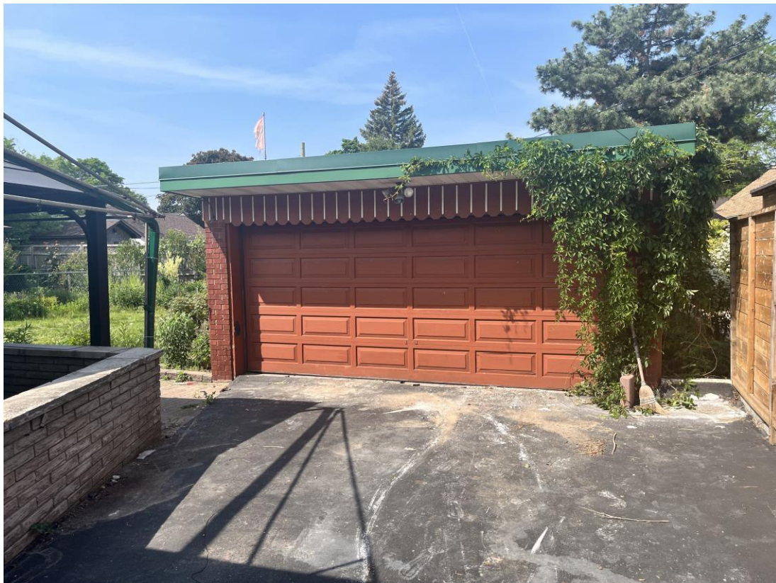
Figure 3 – Existing Detached Garage Photo from Site Visit

Staff visited the subject property on June 2, 2023.