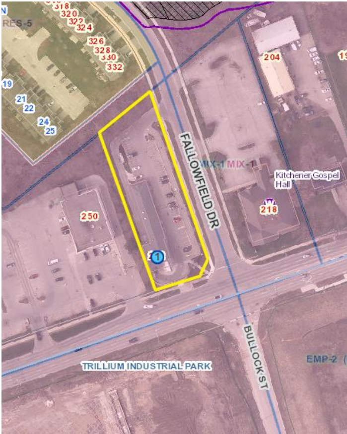
Figure 1: Site location at 232 Bleams Road

City staff has conducted a site visit at the subject property on June 2 nd , 2023.