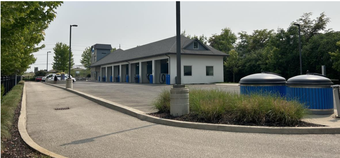
Figure 2: Existing conditions at subject property (rear yard/street side view)