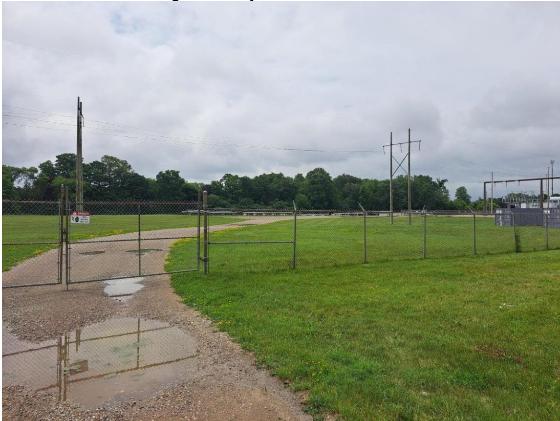
Figure 2: Location of Outdoor Storage Areas

The subject property is identified as 'Green Areas' on Map 2 – Urban Structure and is designated 'Open Space' on Map 3 – Land Use in the City's 2014 Official Plan.