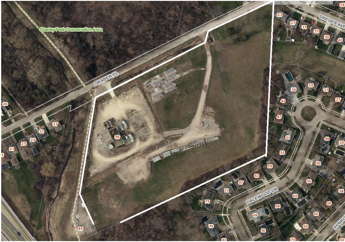
Figure 1: Subject Site – 59 Graber Pl