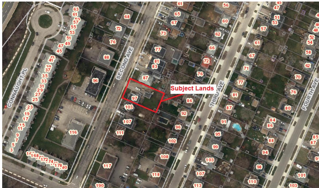
Figure 1: Location map- 97 Second Avenue

The subject property is identified as 'Community Area' on Map 2 – Urban Structure and is designated 'Low Rise Residential' on Map 3 – Land Use in the City's 2014 Official Plan.