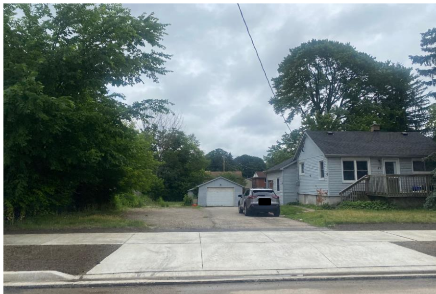
Figure 2: Existing Single Detached Dwelling at 97 Second Avenue

Staff visited the subject property on June 28, 2023.