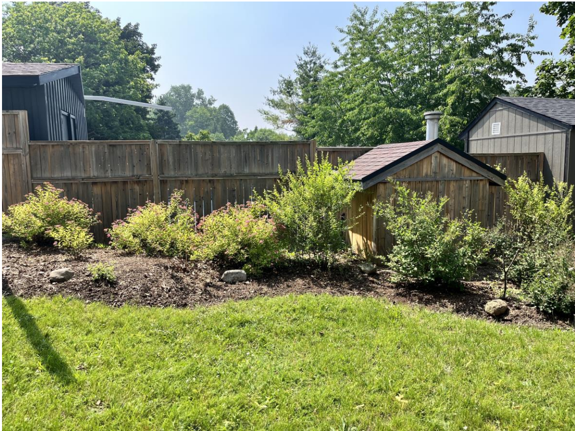
Figure 4 – Existing Accessory Structure (Shed) in Exterior Side Yard