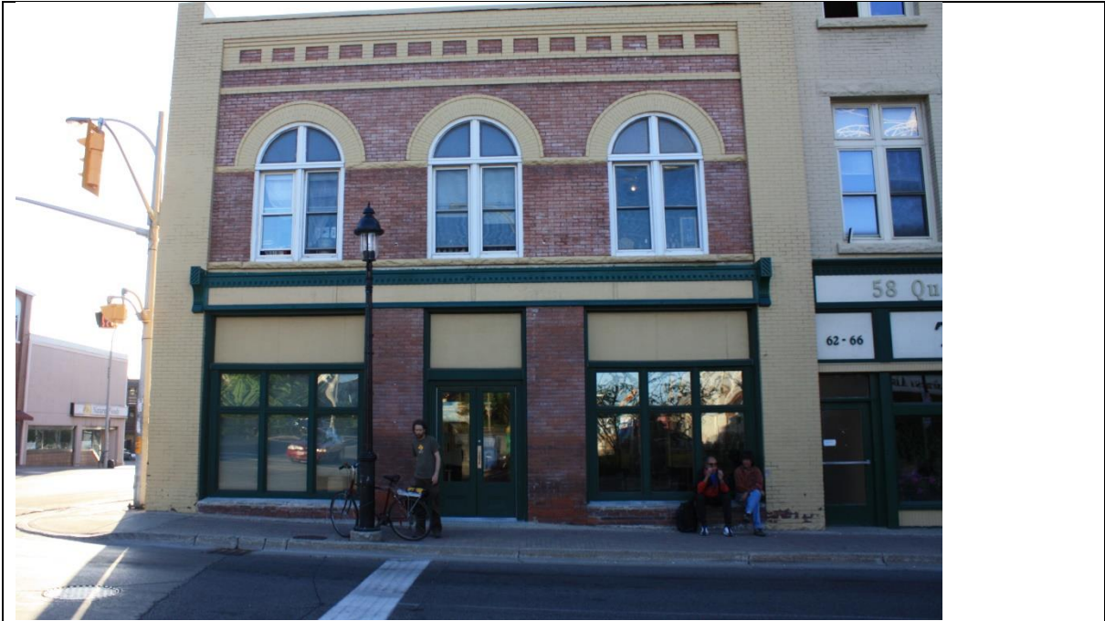
66 Queen Street South – Front (East) Façade