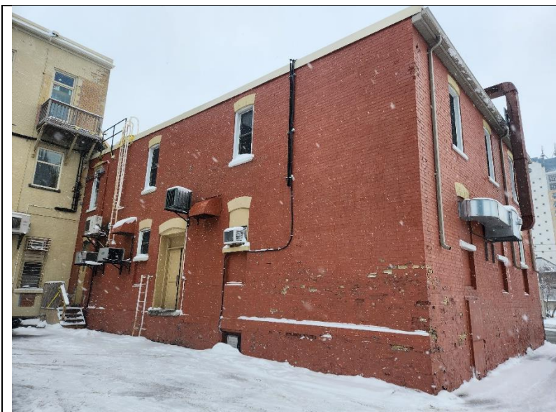
58 Queen Street South – North Façade