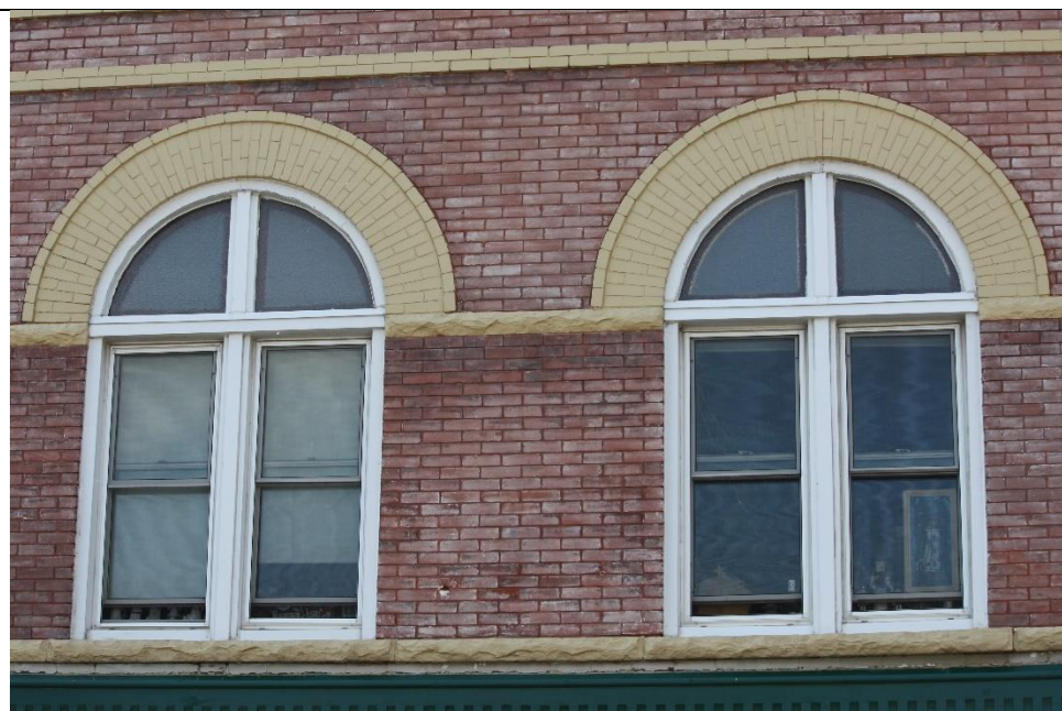
58 Queen Street South – Decorative Brick Voussoirs