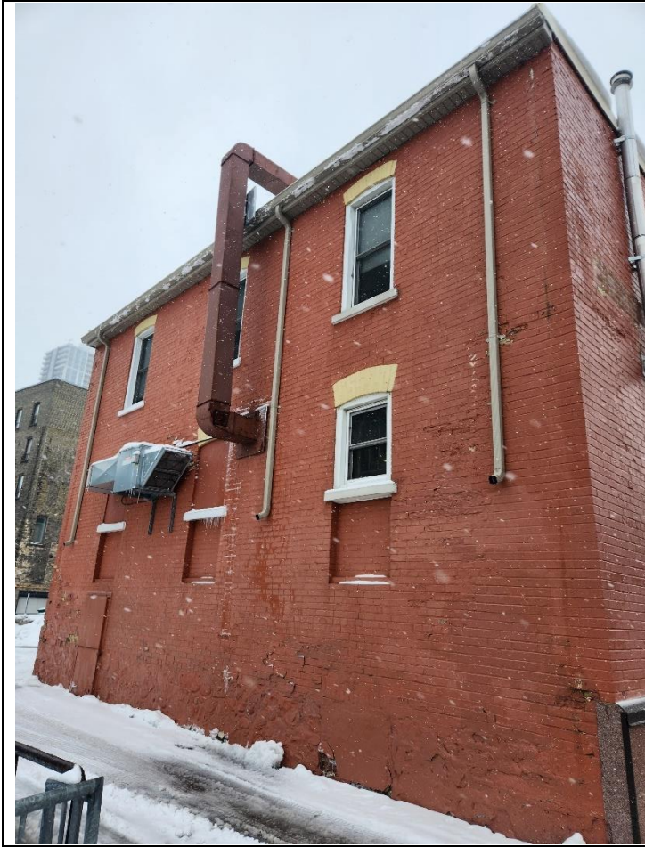
58 Queen Street South – West (rear) façade