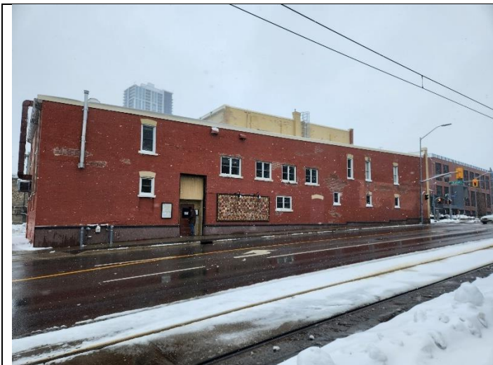
58 Queen Street South – South Façade