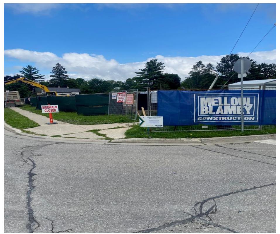
Figure 2: Existing site conditions at 134-152 Shanley Street