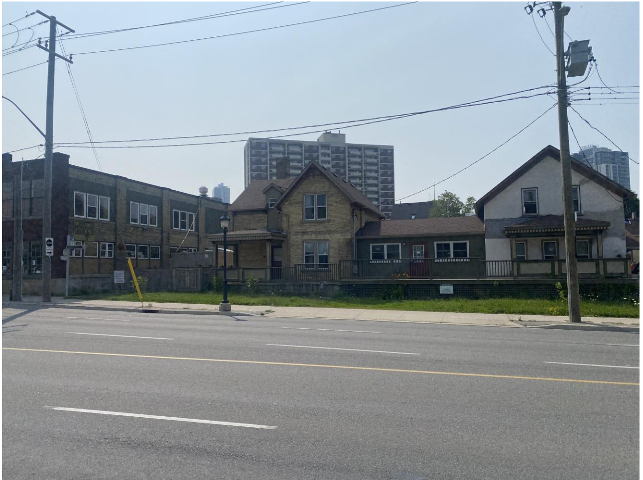
Figure 2 – Existing buildings at 83 and 87 Victoria Street North