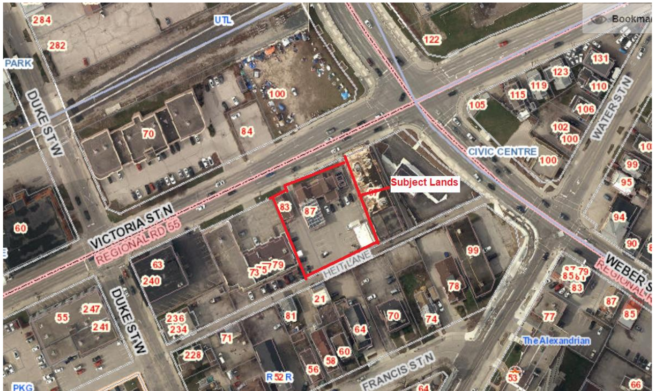
Figure 1 - Location Map: 83 and 87 Victoria Street North

The subject properties are identified as 'Urban Growth Centre' on Map 2 – Urban Structure and are designated 'Innovation District' on Map 4 – Urban Growth Centre in the City's 2014 Official Plan.