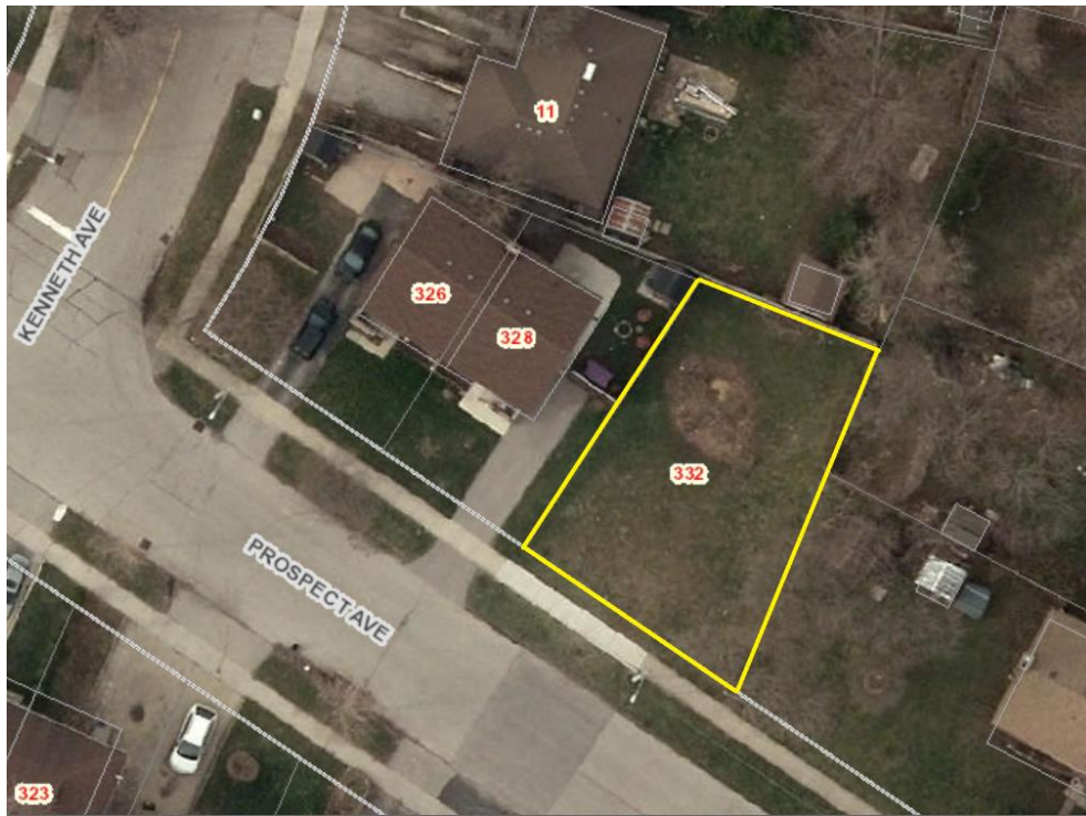
Figure 1 – Ariel Photo of Subject Property

The subject property is identified as 'Community Areas' on Map 2 – Urban Structure and is designated 'Low Rise Residential' on Map 3 – Land Use in the City's 2014 Official Plan.