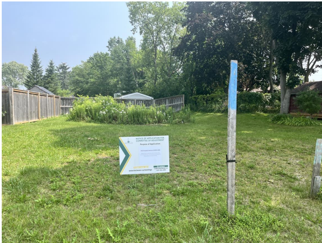
Figure 3 – Front View of Subject Property