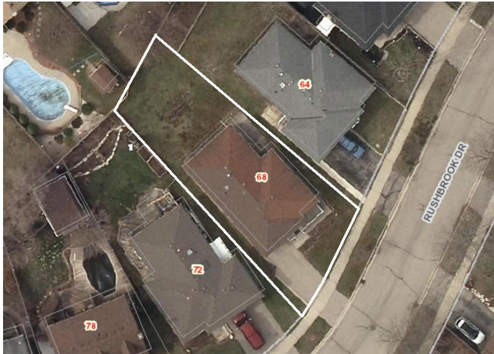
Figure 1 – Location of Subject Property