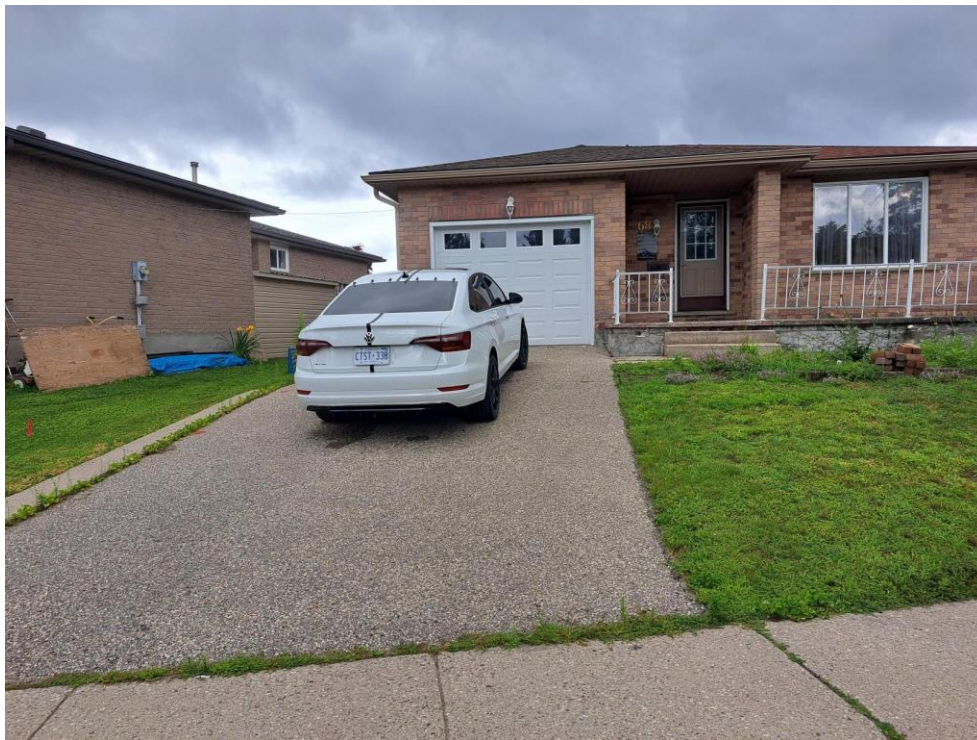
Figure 2 – Existing Driveway

The subject property is identified as 'Community Areas' on Map 2 – Urban Structure and is designated 'Low-Rise Residential' on Map 3 – Land Use in the City's 2014 Official Plan.