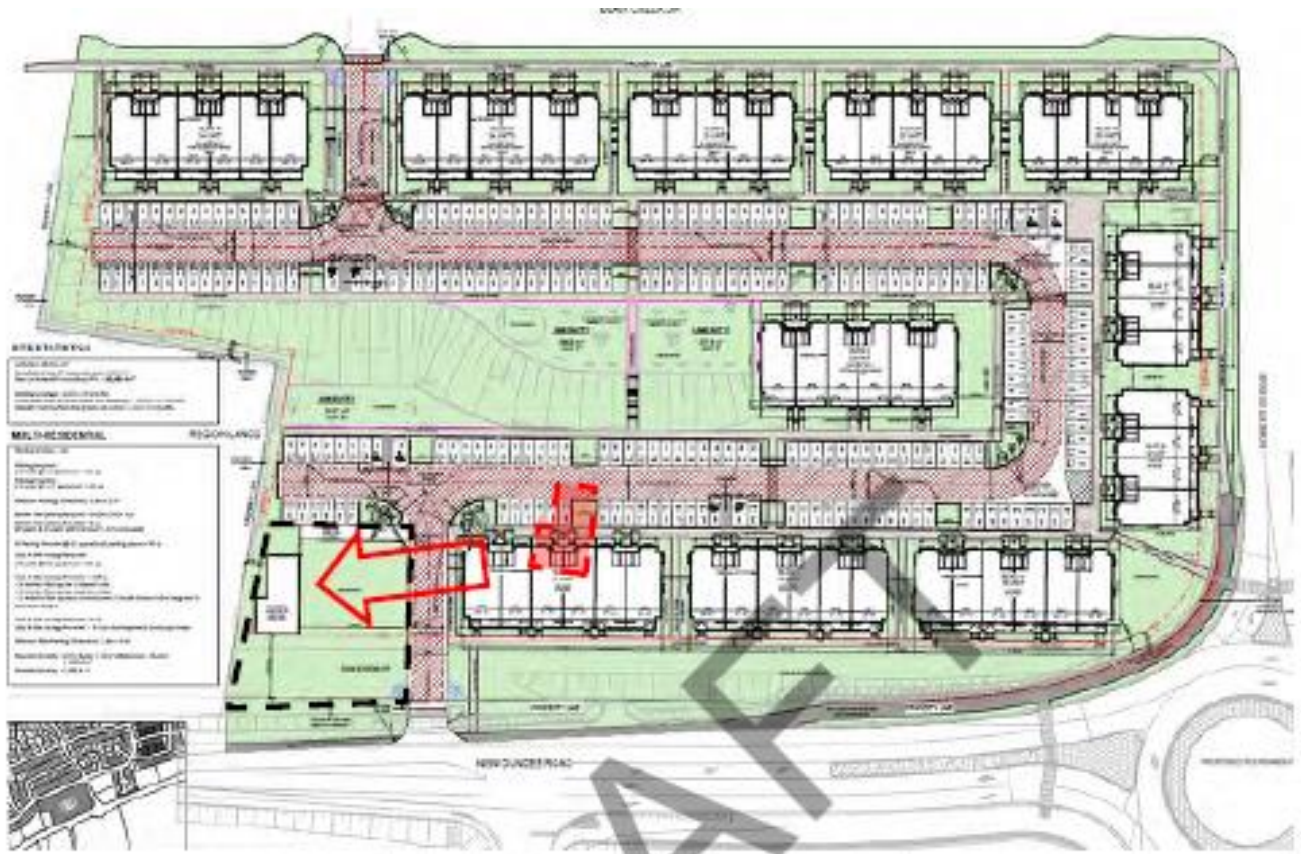
Figure 3: Proposed site plan outlining existing and new location of farmhouse

The applicant is proposing the retention and relocation of the existing farmhouse to a different location on site. The proposal would see the building moved approximately 50 metres to the south-west corner of the site, placed on a new foundation ( Figure 3 ). A structural engineering report dated July 12, 2023 and completed by Tacoma Engineers has confirmed that the existing home is a good candidate for relocation. The additions to the farmhouse added c. 1966 are proposed to be removed ( Figure 4 ). The relocation would facilitate the construction of eleven blocks of townhome units, a central amenity space, 245 surface parking spaces, and an internal laneway with access points onto Blaire Creek Drive and New Dundee Road.