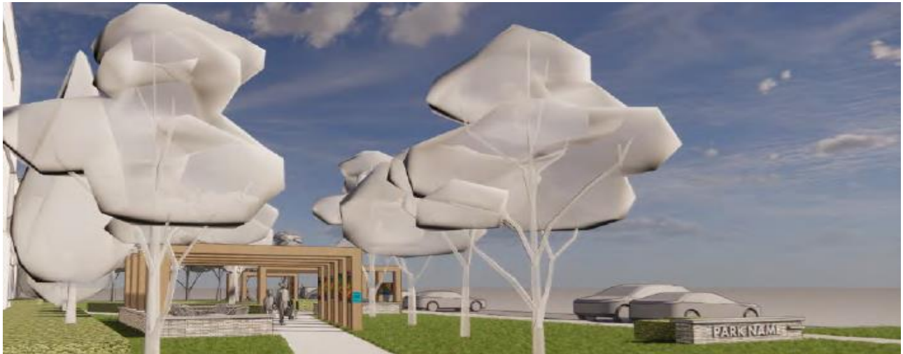
Figure 5: Rendering of Proposed Parkette

Each townhome block is to be comprised of 5-6 units, 3 storeys in height. The townhomes directly along Margaret Avenue have a 3.47 metre setback, which allows for landscaping opportunities in the front yard in addition to ground-floor patio spaces. The townhomes are proposed to have a flat roof to accommodate rooftop patios as well. The design incorporates traditional elements in a contemporary manner. This includes windows with mullions and transom windows and sidelites at the entrance. The materials and colour palette proposed include brick, wood, copper in shades that are appropriate for the character of the area ( Figure 6 )