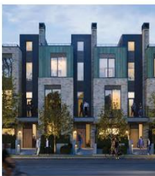
Margaret Towns - Proposal

Each townhome block is to be comprised of 5-6 units, 3 storeys in height. The townhomes directly along Margaret Avenue have a 3.47 metre setback, which allows for landscaping opportunities in the front yard in addition to ground-floor patio spaces. The townhomes are proposed to have a flat roof to accommodate rooftop patios as well. The design incorporates traditional elements in a contemporary manner. This includes windows with mullions and transom windows and sidelites at the entrance. The materials and colour palette proposed include brick, wood, copper in shades that are appropriate for the character of the area ( Figure 6 )