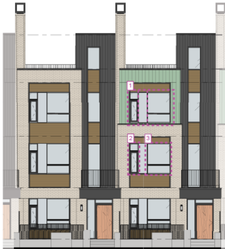
Figure 4: Revised Front Elevation