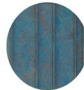
Weathered copper metal siding