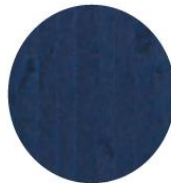
Dark grey / black natural wood siding