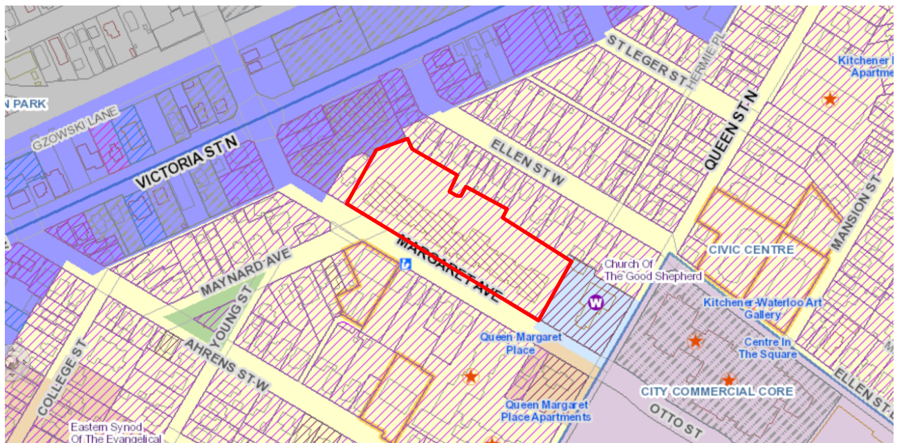
Figure 1: Location Map of Subject Property

The Development Services Department is in receipt of Heritage Permit Application HPA-2023-V-015 seeking permission for the construction of eight (8) blocks of townhomes, an amenity space, and an internal road system on the property municipally addressed as 30-40 Margaret Avenue. The subject property is currently designated under Part V of the Ontario Heritage Act , being located within the Civic Centre Neighbourhood Heritage Conservation District (CCNHCD). It formerly contained several significant mansions; the original homes had fallen into a state of disrepair and were demolished at different points during the 1980's and 1990's. At present 30-40 Margaret Street represents the largest vacant lot in the HCD and is the most discernable opportunity for infill development within the area. Due to its location within the CCNHCD and status under the Ontario Heritage Act , a heritage permit is required to facilitate the construction.