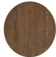
Warm natural wood