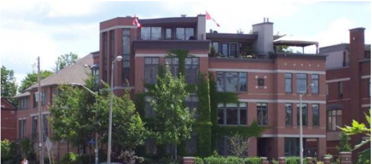
Figure 8: Preferred Examples From the CCNHCD Plan