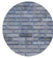
Light cream / buff brick veneer