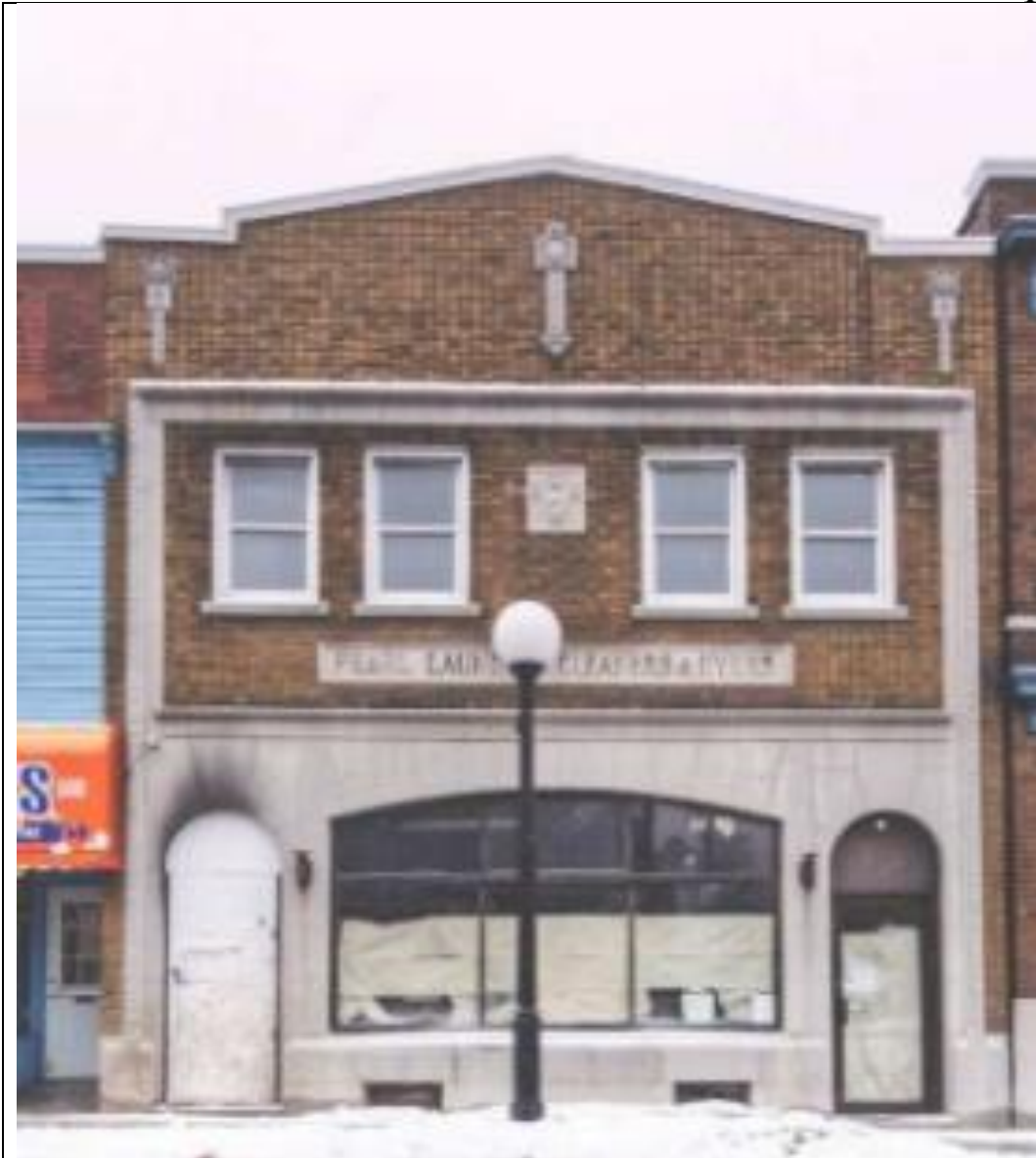
Pearl Laundry Cleaners and Dryers Signage