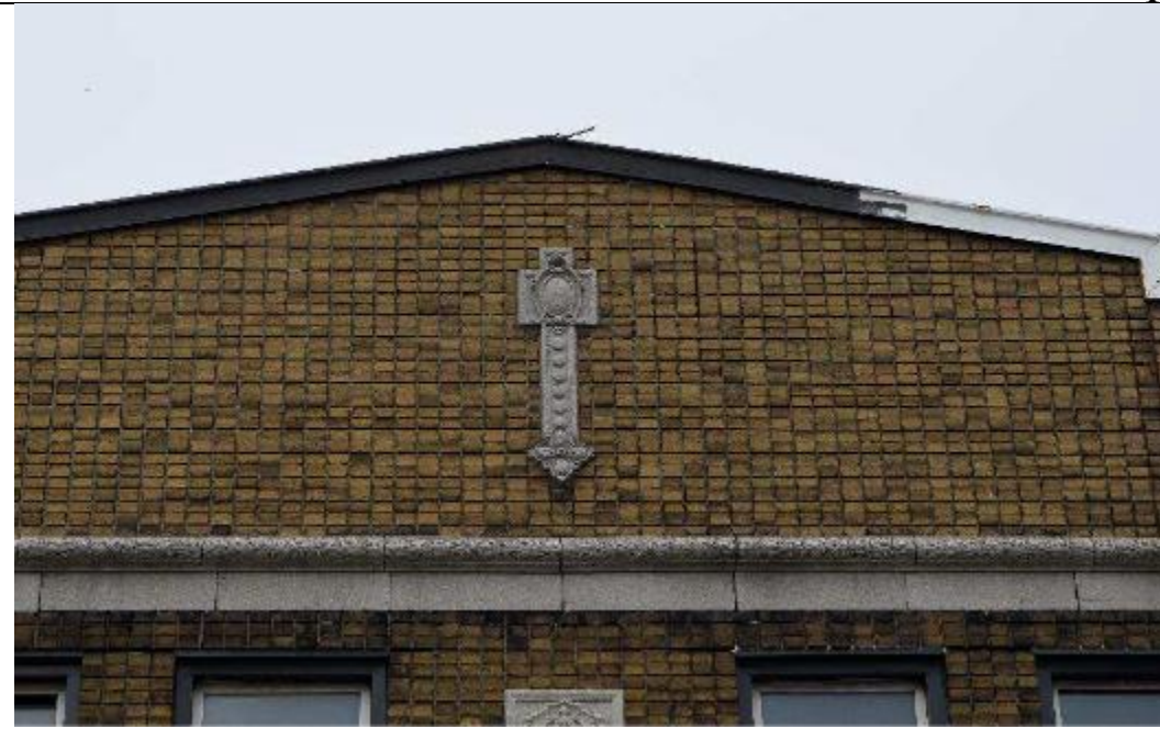
Cast Cross located at center of front parapet