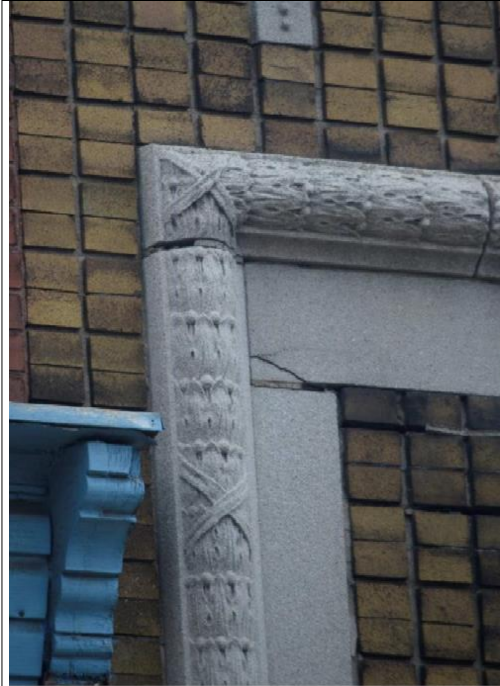
Detail of the Acanthus leaf used In accents