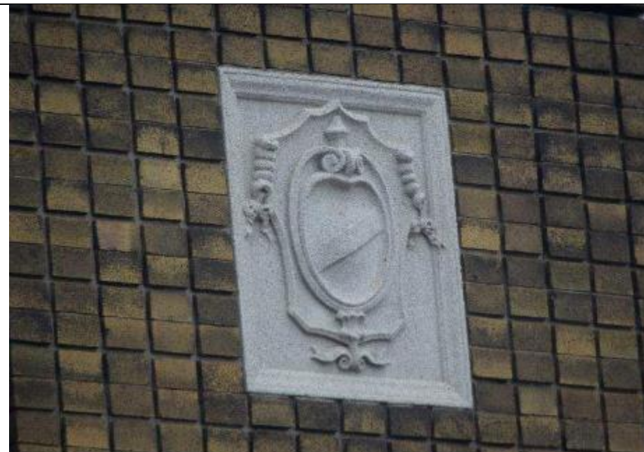
Detail of crest located between second floor windows