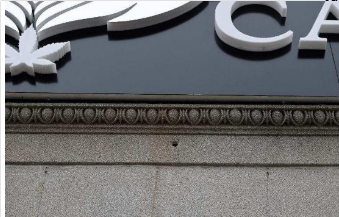
Egg and Dart pattern used on cast detail