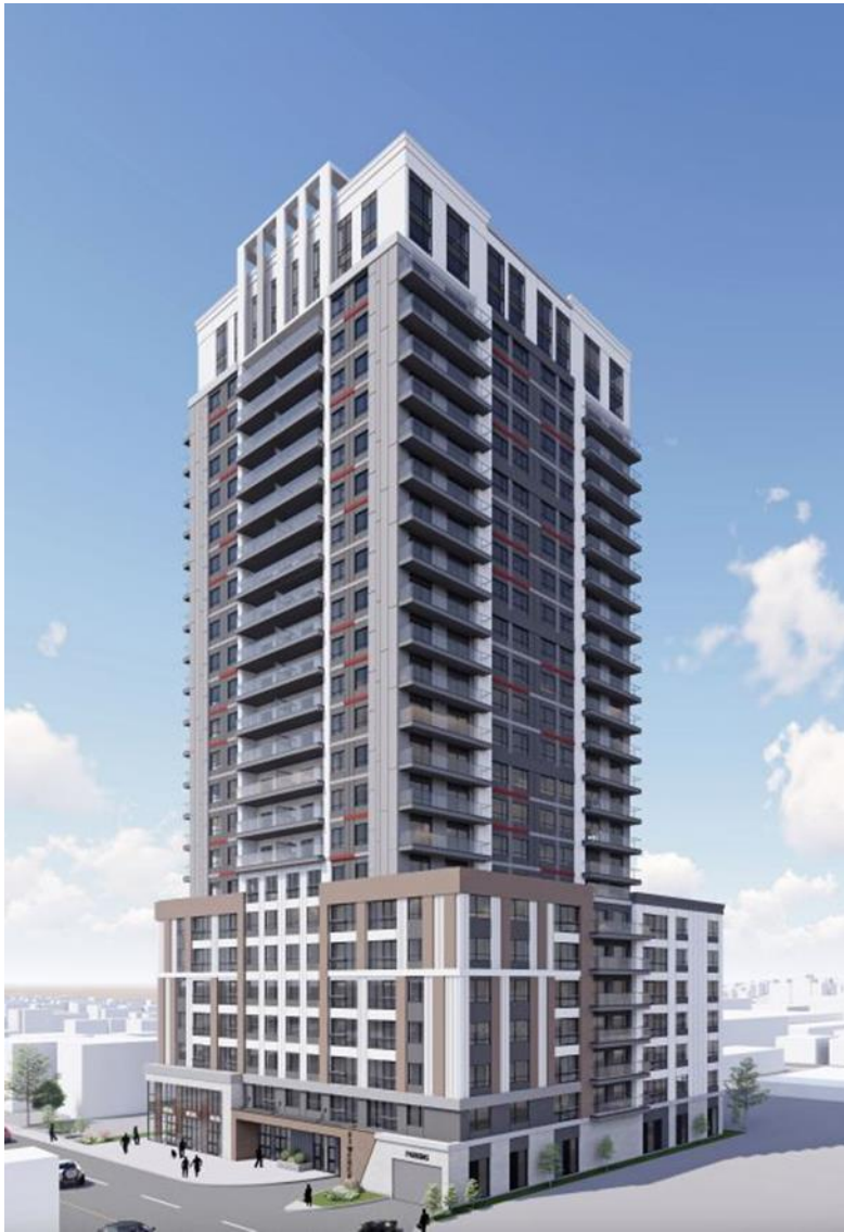
Figure 3 – Proposed Building Rendering: Front elevation along Weber Street East

To facilitate the redevelopment of 83-87 Weber Street East with the proposed development concept, an Official Plan Amendment and a Zoning By-law Amendment are required to change the land use designation and zoning of the subject lands as the existing Official Plan policies only permit a maximum Floor Space Ratio of 3.0 and the zoning only permits a maximum Floor Space Ratio (FSR) of 4.5. The lands are currently designated 'Market District' (Map 4, Urban Growth Centre) in the City of Kitchener Official Plan (2014) and zoned 'Commercial Residential Zone (D-5)' in Zoning By-law 85-1.