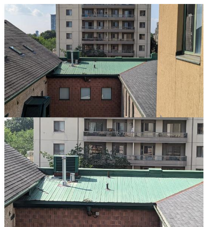
Figure 4: Existing corrugated metal roof

The existing corrugated metal roof is likely not original to the building, nor is it visible from Queen Street South. It is only visible from the inner courtyard of the building. As such, the proposed roof membrane will not be visible from Queen Street South and will not adversely impact the roofline of the 1893 building.