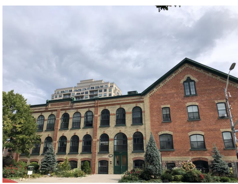
Figure 2: 307 Queen Street South (Bread and Roses)

The subject property is located on the northeast corner of Queen Street South and Courtland Avenue East and is designated under Part IV of the Ontario Heritage Act , by way of by-law 1989-078. The property is comprised of a complex of three buildings having separate construction dates.