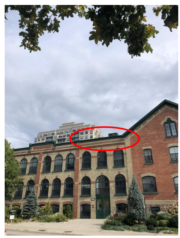
Figure 3: Location of Roof Replacement

To address this issue, the owner/applicant is proposing to replace the corrugated metal roof with a 2-ply modified bitumen roof membrane system with a granular surface. This proposed roof system is a modern cold applied peel and stick flameless installation, is used on low-slope roofs, and provides a flexible waterproof membrane. Modified bitumen roofing is made from asphalt combined with polymerized rubber or plastic and then reinforced with fibreglass to create a waterproof membrane. The proposed roof will be integrated with the adjacent asphalt shingle roof and the adjacent stone coated steel shingle roof and will be grey in colour.