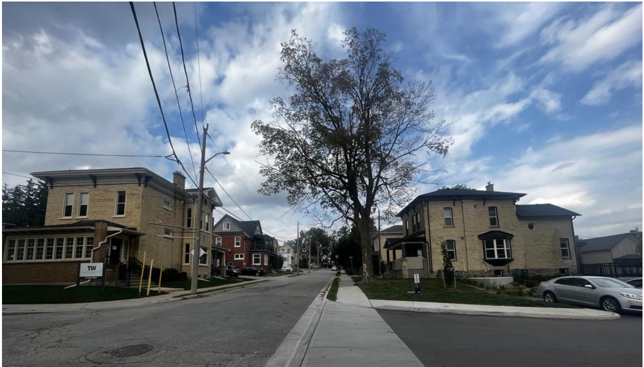
Figure 5: North-East View Down Scott Street

The contextual value of 87 Scott Street also relates to its relationship to 91 Scott Street, the building located across Pearl Place to the northeast. While the architectural style of the homes on the rest of the street varies, 91 Scott Street is also a representative example of the Italianate architectural style, and mirrors 87 Scott Street in terms of fenestration and other design elements. The two buildings together provide a distinctive and balanced frame to the entrance of Pearl Place, and the visual impact of the totality is significant.