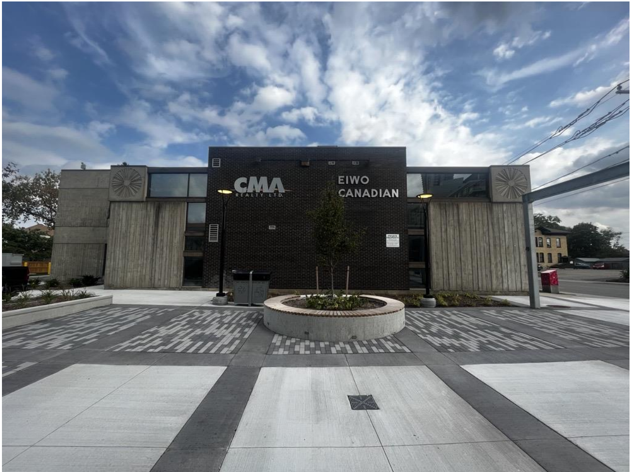
Figure 8: 82 Weber Street East (West Side Elevation)

The expression of the exterior walls of the building are of note, as the cast-in-place concrete material used forms of rough sawn hemlock boards to create a textured surface. This technique displays the contemporary interest of using texture from natural materials to give greater character to concrete, which originated from Le Corbusier's experiments in baton-brut in the late 1940's. The textured concrete is complimented by the wooden sunscreens that shield the windows of the façade that fronts onto Weber Street.