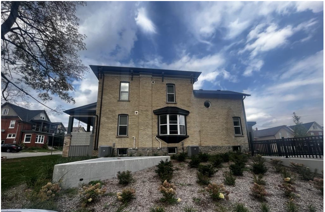
Figure 3: 87 Scott Street After Rehabilitation (West Side Façade)