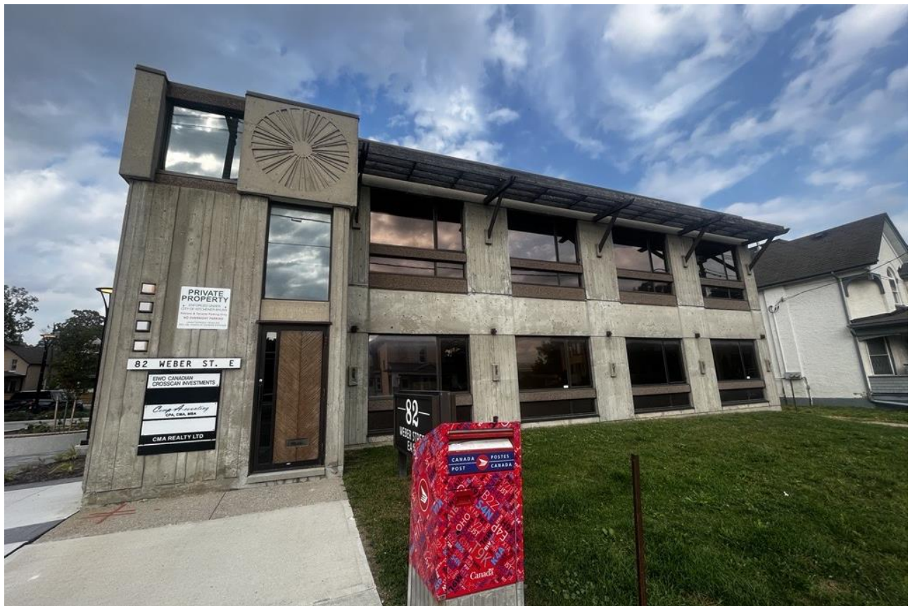
Figure 7: 82 Weber Street East (Front Elevation)

82 Weber Street East is an excellent example of modern or modernist architecture within the Waterloo Region. The modernist style is characterized by the use of construction materials such as glass, steel, and reinforced concrete and was a signature type of architecture for institutional and corporate buildings from the 1920's into the 1980's.