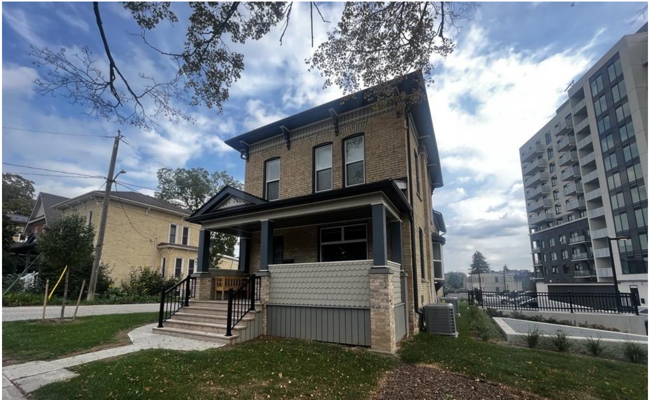
Figure 2: 87 Scott Street After Rehabilitation (Front Elevation)