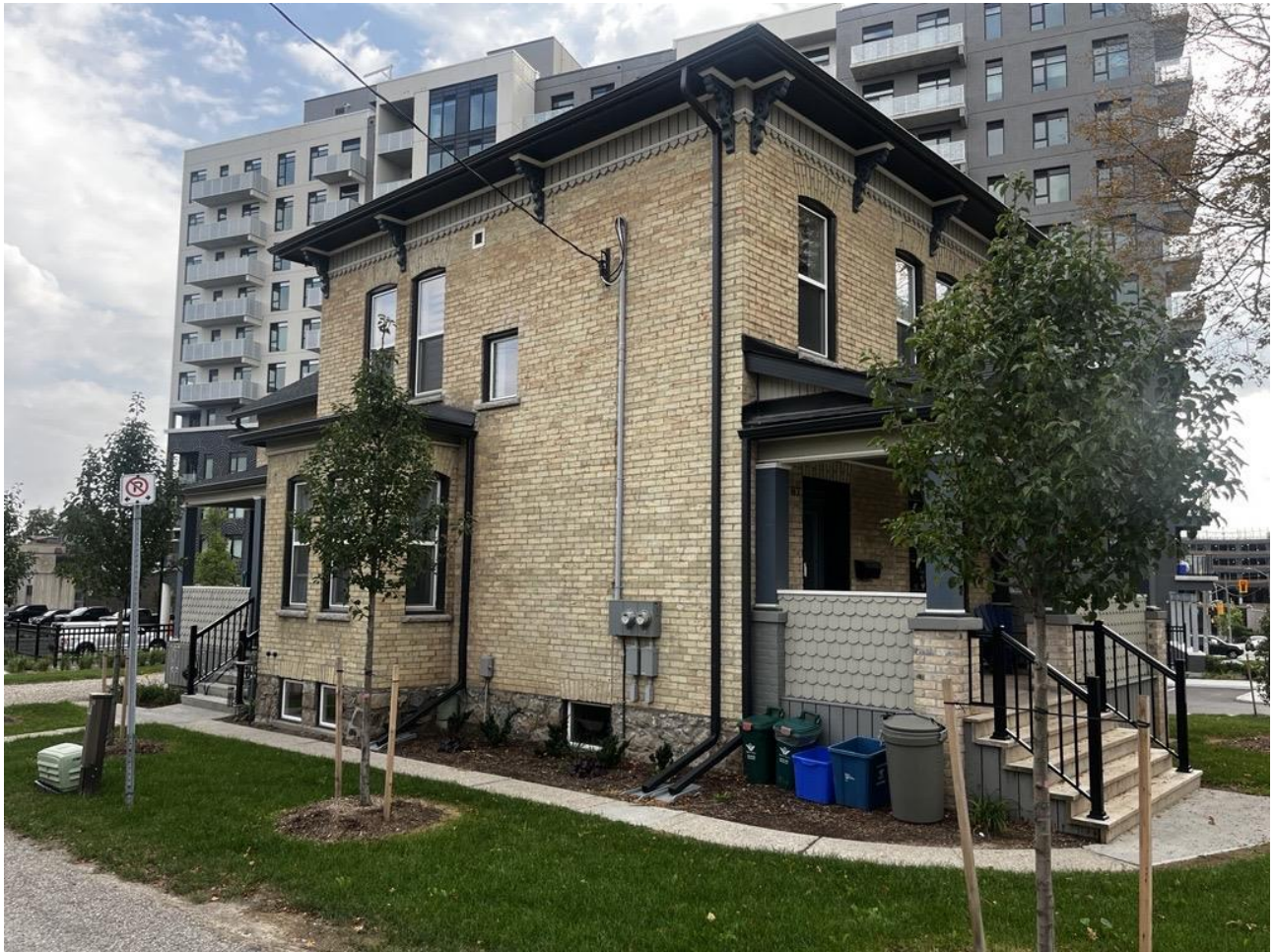
Figure 4: 87 Scott Street After Rehabilitation (East Side Façade)