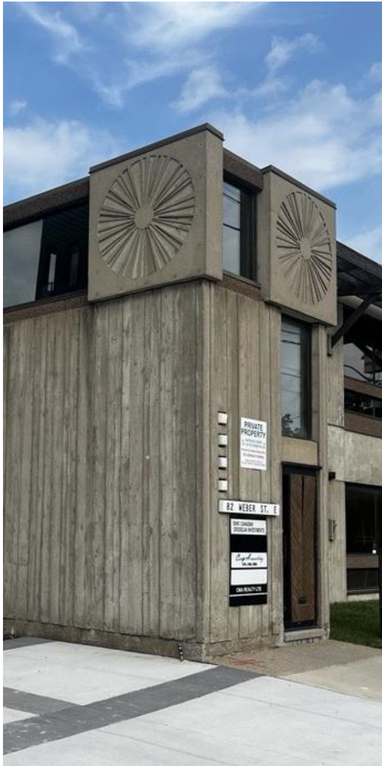
Figure 9: 82 Weber Street East Façade Detailing

The building materials primarily consist of concrete. As such, the building possesses a high level of durability and is in good condition with very little alteration.