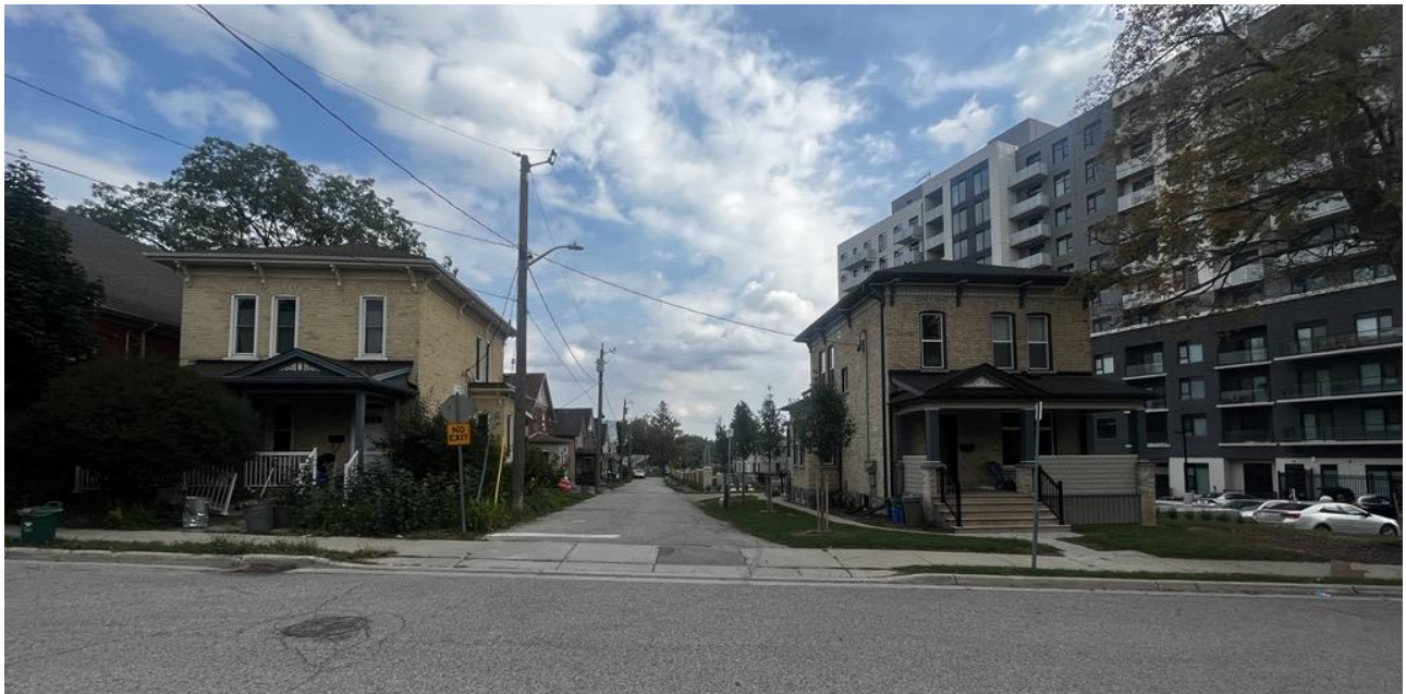
Figure 6: 87 Scott Street and 91 Scott Street

The contextual value of 87 Scott Street also relates to its relationship to 91 Scott Street, the building located across Pearl Place to the northeast. While the architectural style of the homes on the rest of the street varies, 91 Scott Street is also a representative example of the Italianate architectural style, and mirrors 87 Scott Street in terms of fenestration and other design elements. The two buildings together provide a distinctive and balanced frame to the entrance of Pearl Place, and the visual impact of the totality is significant.