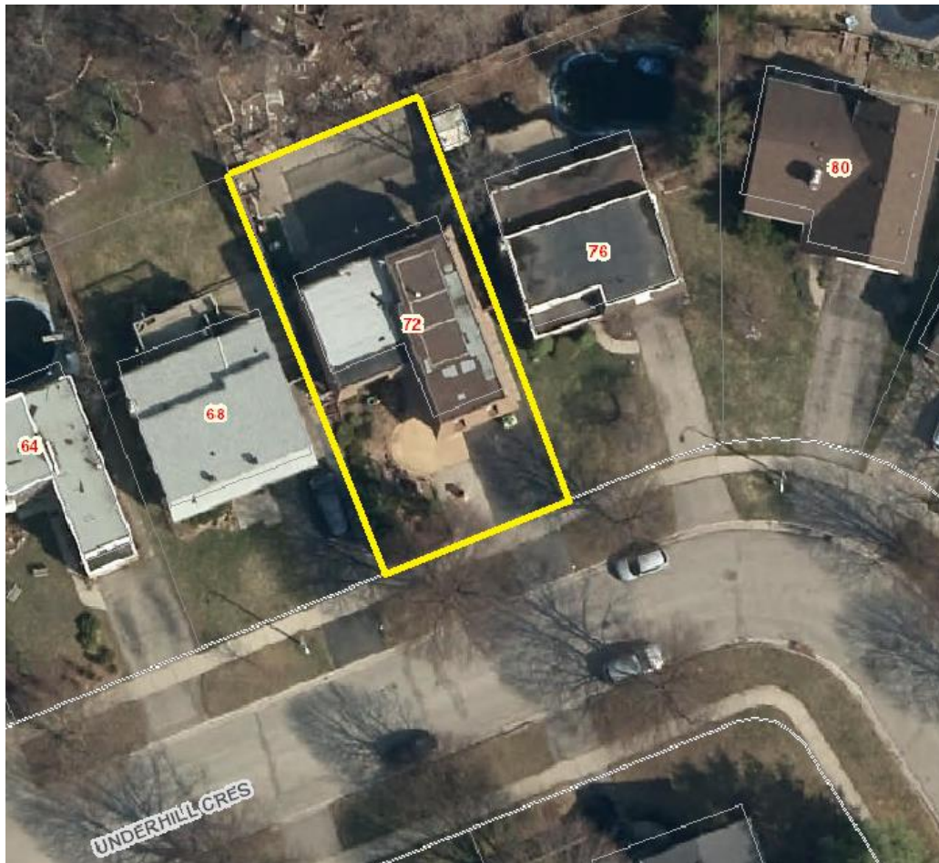
Figure 1 – Location of Subject Property