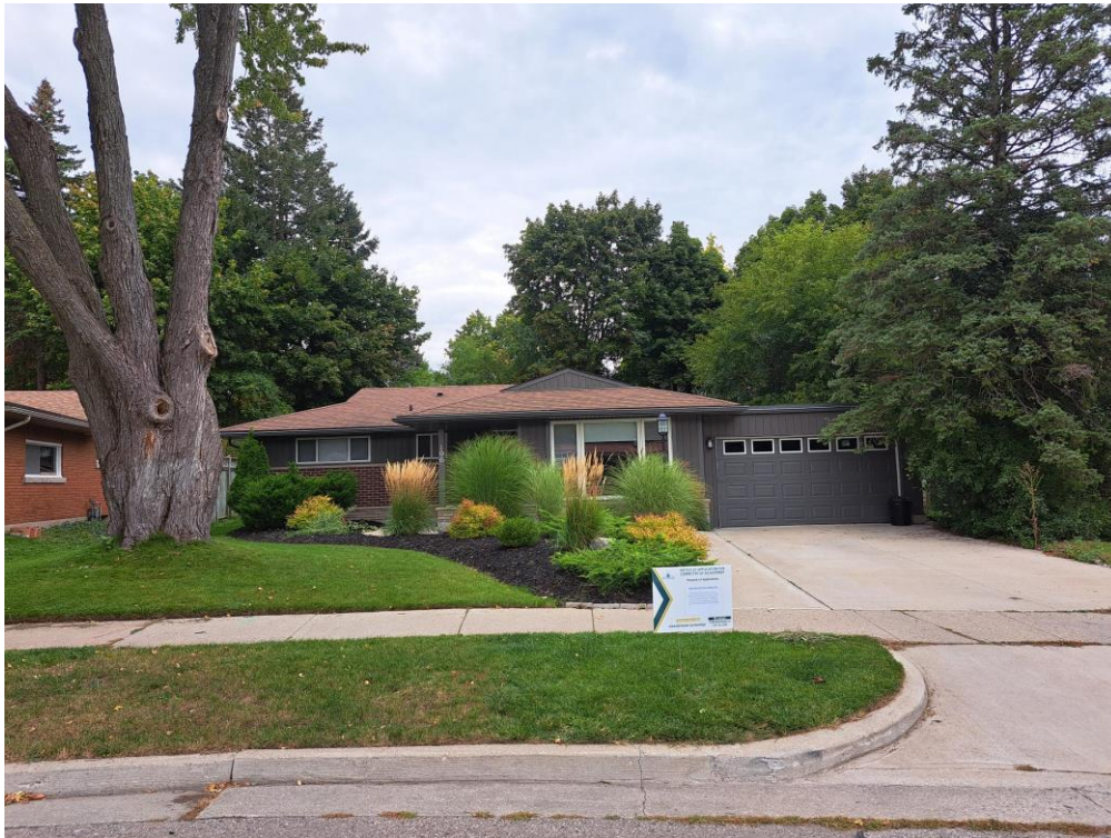
Figure 2 – Photo of Subject Property

The subject property is identified as 'Community Areas' on Map 2 – Urban Structure and is designated 'Low Rise Residential' on Map 3 – Land Use in the City's 2014 Official Plan.