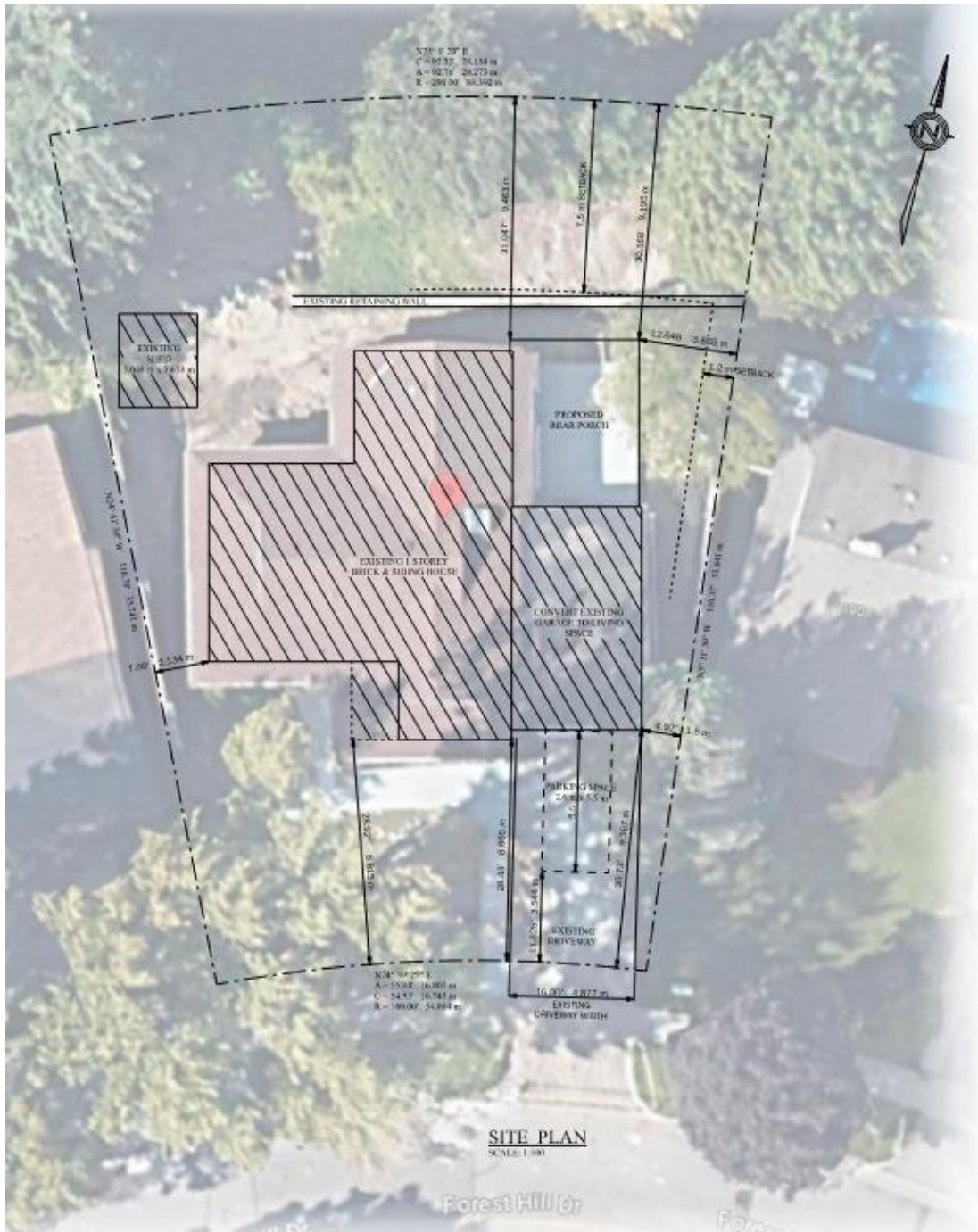
Attachment A – Site Plan