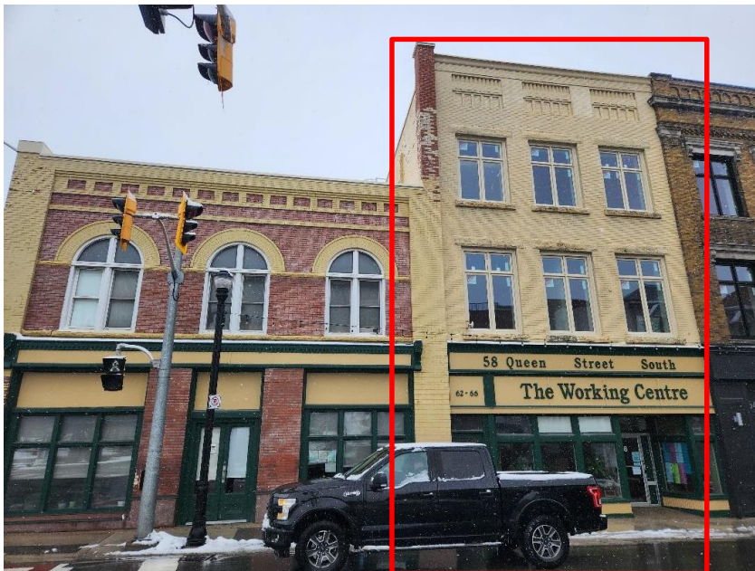
Figure 2: Front Façade of 58 Queen Street South

Identifying and protecting cultural heritage resources within the City of Kitchener is an important part of planning for the future, and helping to guide change while conserving the buildings, structures, and landscapes that give the City of Kitchener its unique identity. The City plays a critical role in the conservation of cultural heritage resources. The designation of property under the Ontario Heritage Act is the main tool to provide long-term protection of cultural heritage resources for future generations. Designation recognizes the importance of a property to the local community; protects the property's cultural heritage value; encourages good stewardship and conservation; and promotes knowledge and understanding about the property. Designation not only publicly recognizes and promotes awareness, but it also provides a process for ensuring that changes to a property are appropriately managed and that these changes respect the property's cultural heritage value and interest.