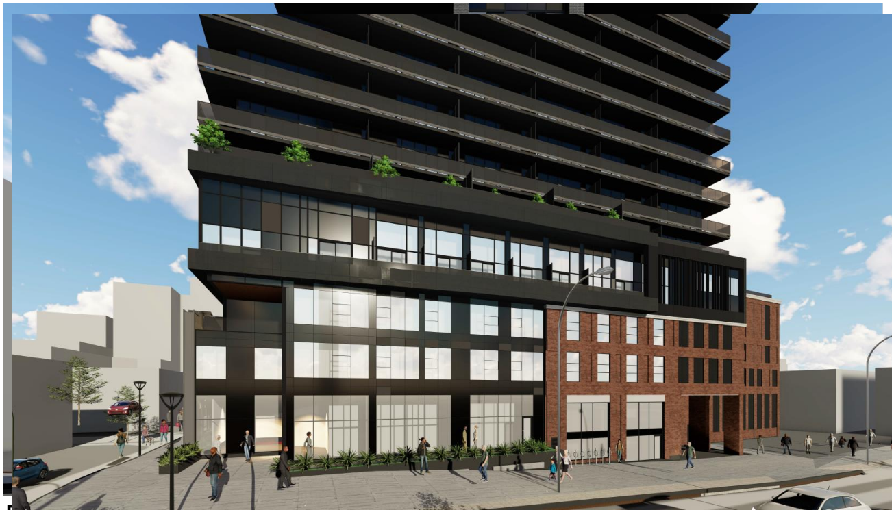
Figure 2: Rendering of the proposed development showing how 90-92 Queen Street is to be Figure 3: Rendering of the side facade of the proposed development along Charles Street West.

The proposed redevelopment encompasses the lands municipally addressed as 88-108 Queen Street South and 1-3 Charles Street West. Of these properties, 90-92 Queen Street is the only one with heritage status. A 44-storey residential condominium tower is proposed to be constructed. The Art-Deco style façade of 90-92 Queen Street is proposed to be retained and incorporated into the podium of the new tower. In addition, the facades of 96-108 Queen Street South are proposed to be reconstructed and incorporated into the base. The reconstructed façade will include the entrance to the parking garage in a manner that retains the aesthetic of the structure. Though these structures were determined to have no cultural heritage significance or value, it was the opinion of Heritage Planning Staff that their retention was important as when viewed in its entirety, the facades reflected the eclectic mix of architectural styles characteristic of the area and contributed greatly to the Queen Street South streetscape. The applicants worked with Staff to accommodate this request and produce the existing design. Above the retained facades, the rest of the podium is proposed to be setback and lifted to create greater visual separation between the heritage resource and the new construction.