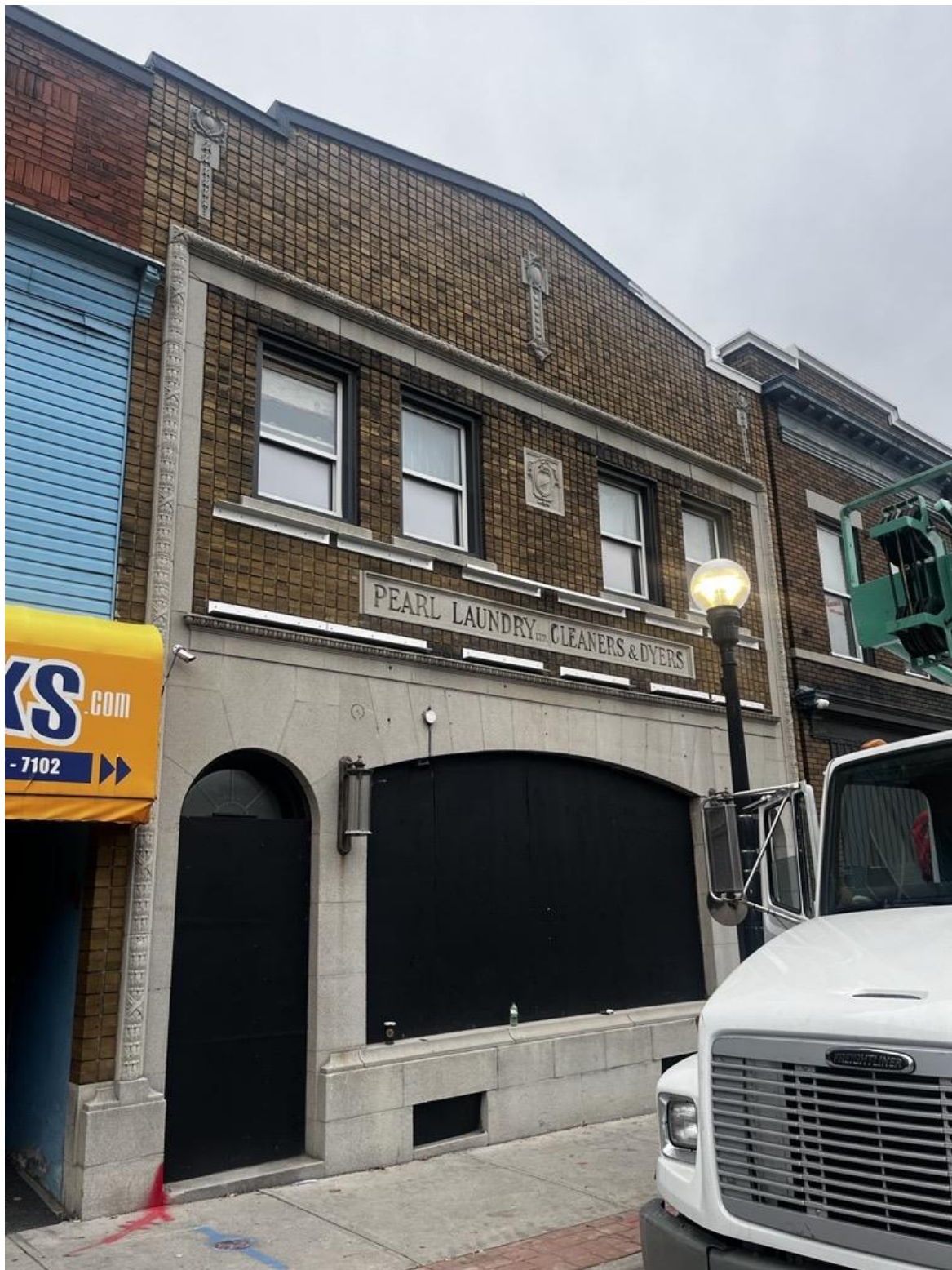
Figure 2: Front façade of 90-92 Queen Street South