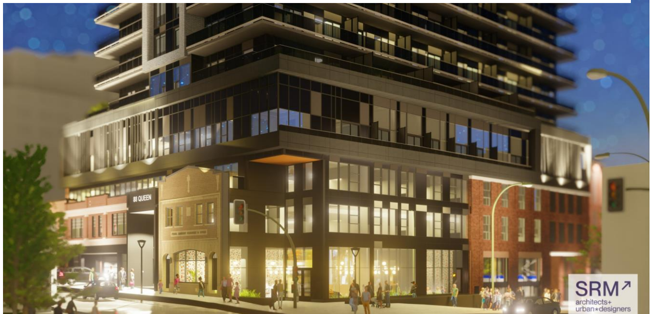
Figure 4: Rendering of the proposed development at night, as viewed from the Queen Street and Charles Street intersection.