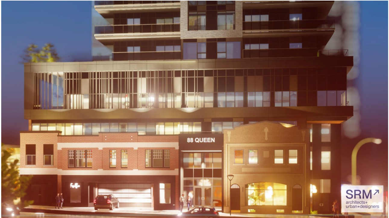
Figure 5: Rendering of the proposed development at night, as viewed from Queen Street South.