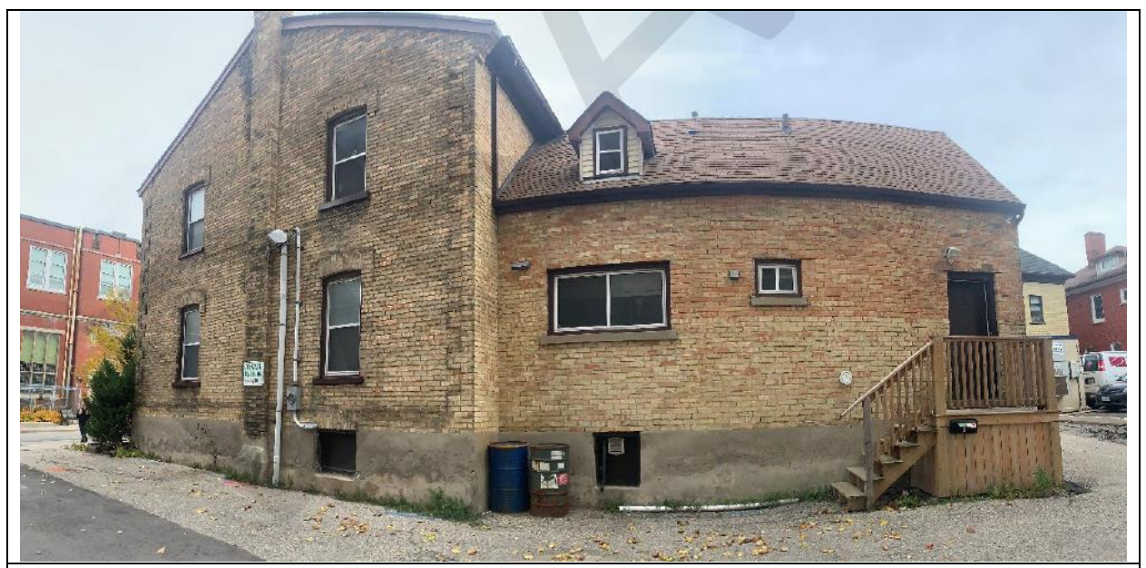
Side Elevation (looking North)