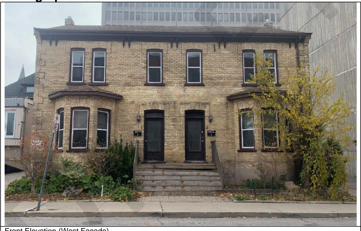
Front Elevation (West Façade)