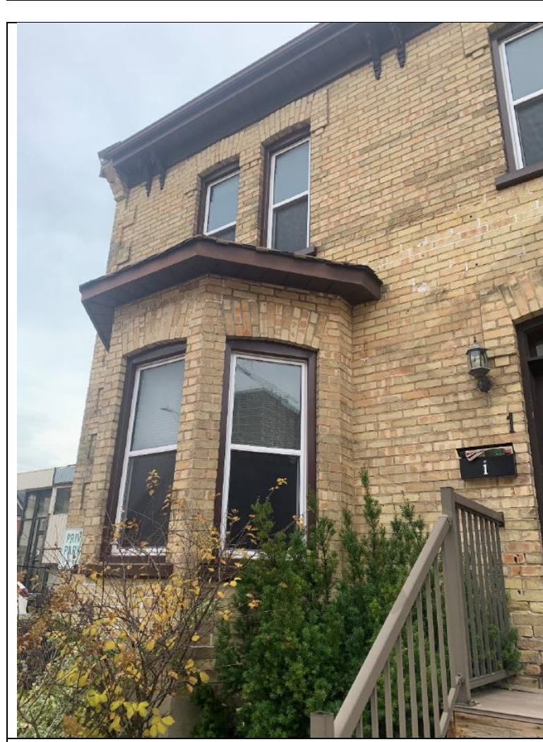
Detailing of bay window and voussoirs, brick voussoirs with drip molds and brackets.