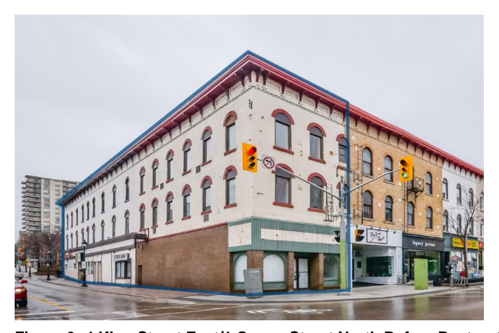
Figure 3: 4 King Street East/1 Queen Street North Before Restoration

A full assessment of 4 King Street East/1 Queen Street North has been completed and included a field evaluation and detailed archival research. The findings concluded that the subject property meets the criteria for designation. An updated Statement of Significance on the property's cultural heritage value was taken to the Heritage Kitchener Committee on August 1<sup>st</sup>, 2023. On this meeting date, the Committee recommended that pursuant to Section 29 of the Ontario Heritage Act , the cultural heritage value or interest of 4 King Street East/1 Queen Street North be recognized, and designation pursued. This work was