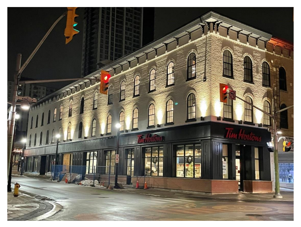
Figure 2: 4 King Street East/1 Queen Street North After Restoration