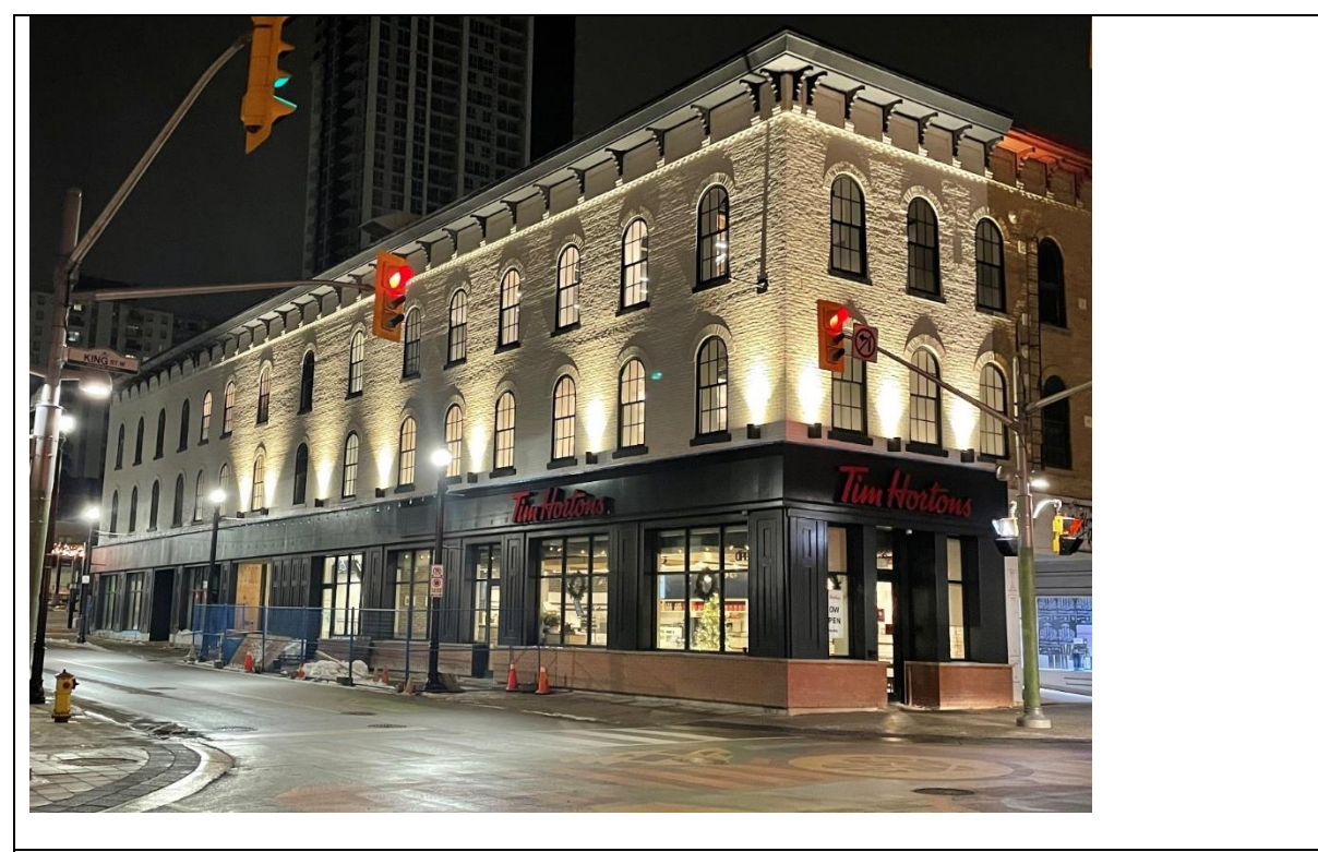
4 King Street East/1 Queen Street North – Front (South) and Side (West) Façade