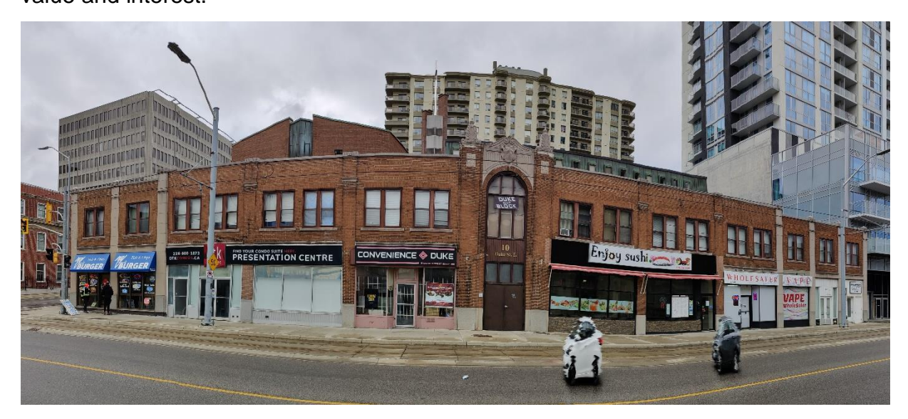
Figure 2: Front Facade of 2-22 Duke Street East

Identifying and protecting cultural heritage resources within the City of Kitchener is an important part of planning for the future, and helping to guide change while conserving the buildings, structures, and landscapes that give the City of Kitchener its unique identity. The City plays a critical role in the conservation of cultural heritage resources. The designation of property under the Ontario Heritage Act is the main tool to provide long-term protection of cultural heritage resources for future generations. Designation recognizes the importance of a property to the local community; protects the property's cultural heritage value; encourages good stewardship and conservation; and promotes knowledge and understanding about the property. Designation not only publicly recognizes and promotes awareness, but it also provides a process for ensuring that changes to a property are appropriately managed and that these changes respect the property's cultural heritage value and interest.