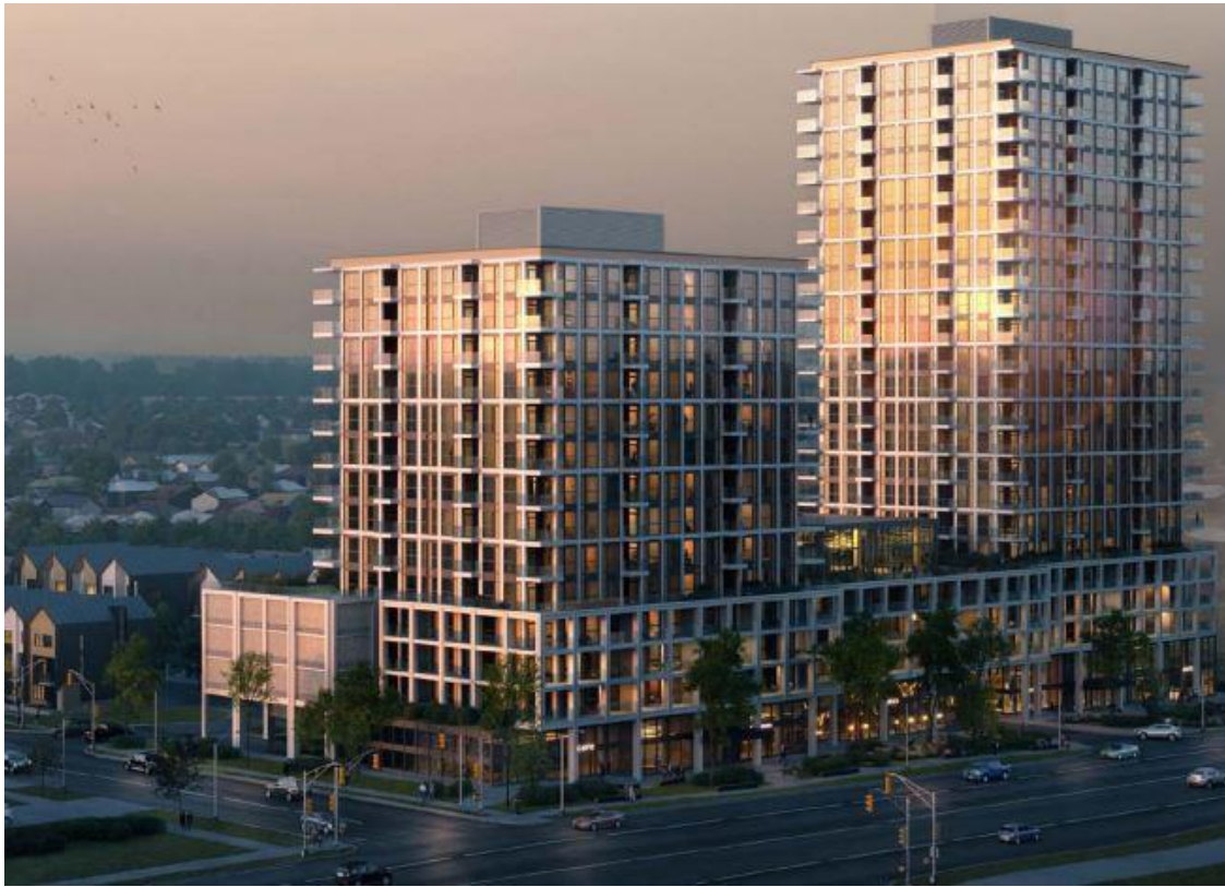
Figure 4 – Proposed Building Rendering: Front elevation along Fischer-Hallman Rd.

To facilitate the development of 1198 Fischer-Hallman Road with the proposed development concept, an Official Plan Amendment and Zoning By-law Amendment are required to change the land use designation and zoning of the subject lands as the existing Official Plan policies only permit a maximum Floor Space Ratio (FSR) of 4.0 and the zoning only permits a maximum FSR of 0.6. The lands are currently designated 'Mixed Use Two' in the Rosenberg Secondary Plan in the Official Plan and zoned 'Residential Six Zone (R-6)' in Zoning By-law 85-1. The subject lands were designated in the Rosenberg Secondary Plan to permit medium density residential uses, however the zoning was not updated through that planning process, therefore property specific applications are required.