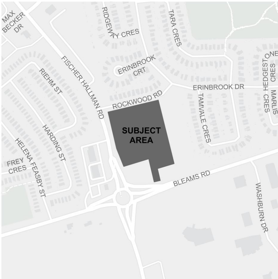
Figure 1 - Location Map: 1198 Fischer Hallman Road

The surrounding neighbourhood consists of low rise residential uses to the north and east, and a variety of commercial uses to the west and south. The property addressed as 1200 Fischer-Hallman Road at the intersection of Fischer Hallman Road and Bleams Road, is not part of this application and has received conditional site plan approval for a 34-storey, 323 residential multiple dwelling.