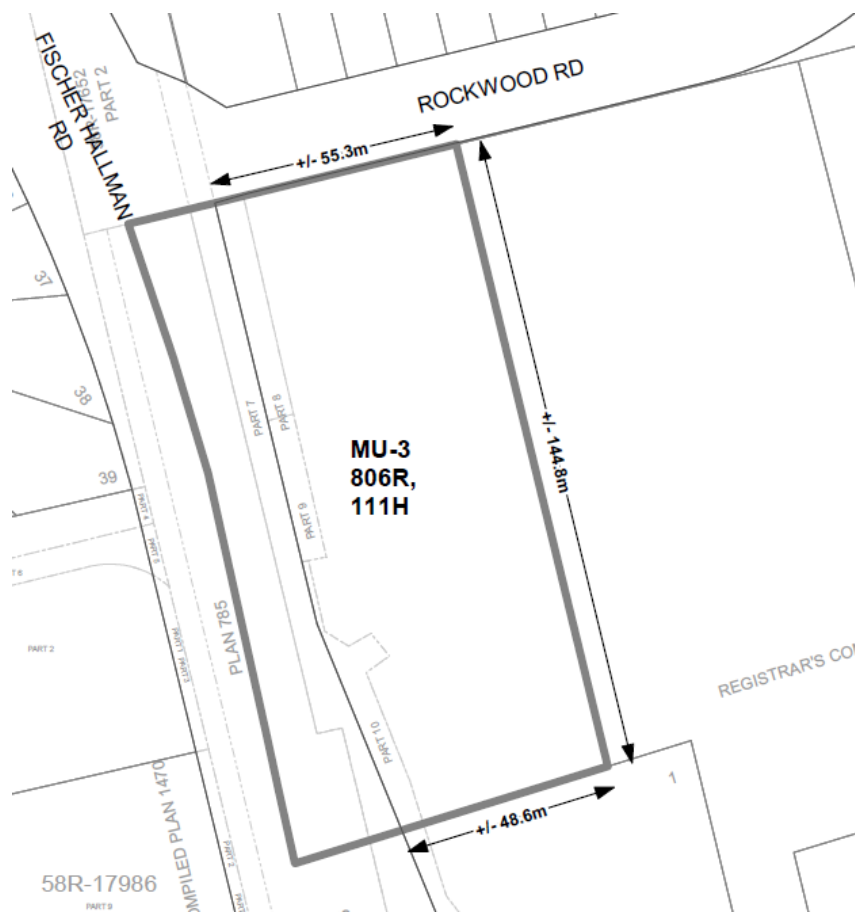
Figure 2 – Zoning Area Map: 1198 Fischer Hallman Road