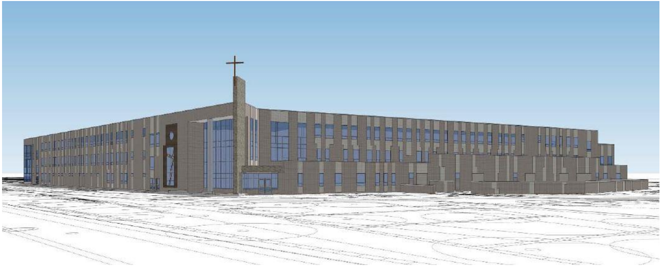
Figure 3 – Proposed Building: Front elevation from Fairway Rd and Woolner Tr.

To facilitate the development of 20 Woolner Trail with the proposed school, an Official Plan Amendment and Zoning By-law Amendment are required to change the land use designation and zoning of the subject lands. The lands are currently designated 'Mixed Use' and 'Low Rise Residential' in the City of Kitchener's Official Plan (2014). The lands are currently identified as a 'Neighbourhood Node' in the Official Plan. The applicant is proposing to change the land use designation to 'Institutional' and to add a Site Specific Policy Area No. 67 to Map 5. Policy 15.D.12.67 is proposed to be added to the text of the Official Plan to permit an 'Institutional' land use designation and a 'Major Institutional' use within a Neighbourhood Node Urban Structure Component.