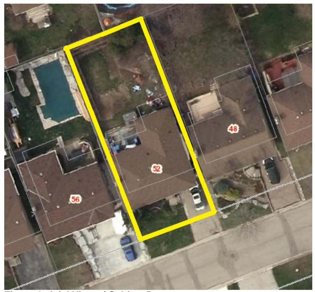
Figure 1: Ariel View of Subject Property

The subject property is located on the north side of Sabrina Crescent and currently is used as a single detached dwelling.