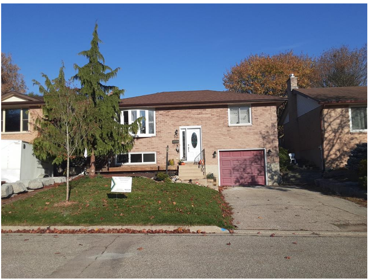
Figure 2: Front View of Subject Property

Staff conducted a visit to the subject property on November 1<sup>st</sup>, 2023.