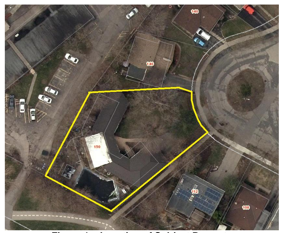
Figure 1 – Location of Subject Property