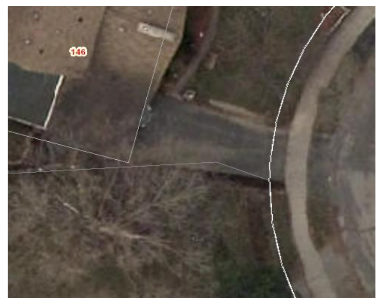
Figure 3 – Image of Neighbouring Driveway Encroaching on Subject Property