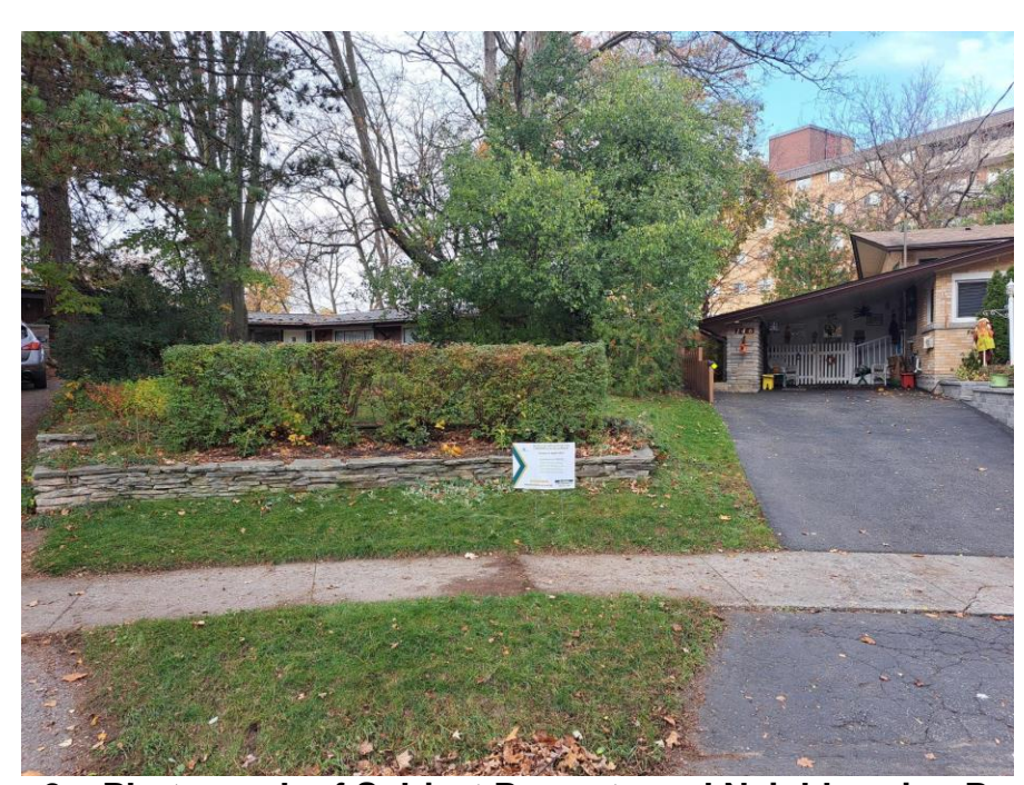
Figure 2 – Photograph of Subject Property and Neighbouring Property

The purpose of the application is to adjust the lot lines of the subject property, known as 150 Marlborough Avenue, and the neighbouring property, known as 146 Marlborough Avenue. The driveway of 146 Marlborough Avenue encroaches on the property of 150 Marlborough Avenue, as shown below in 'Figure 3'. A portion of the subject property, shown as 'Part 1' on 'Figure 4 – Detailed Sketch', will be transferred to 146 Marlborough Avenue to solve the issue of encroachment.