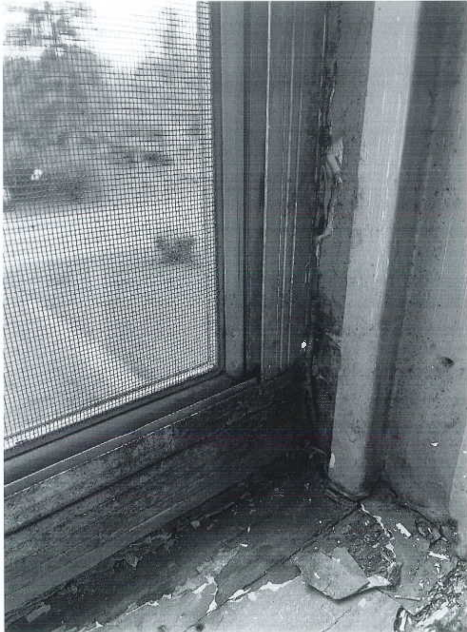
North facing bedroom window