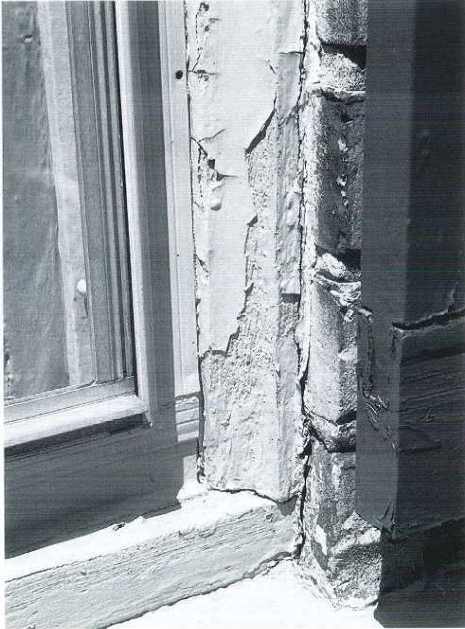
East side Dining room