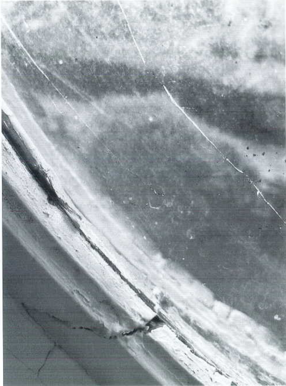
Round window frame