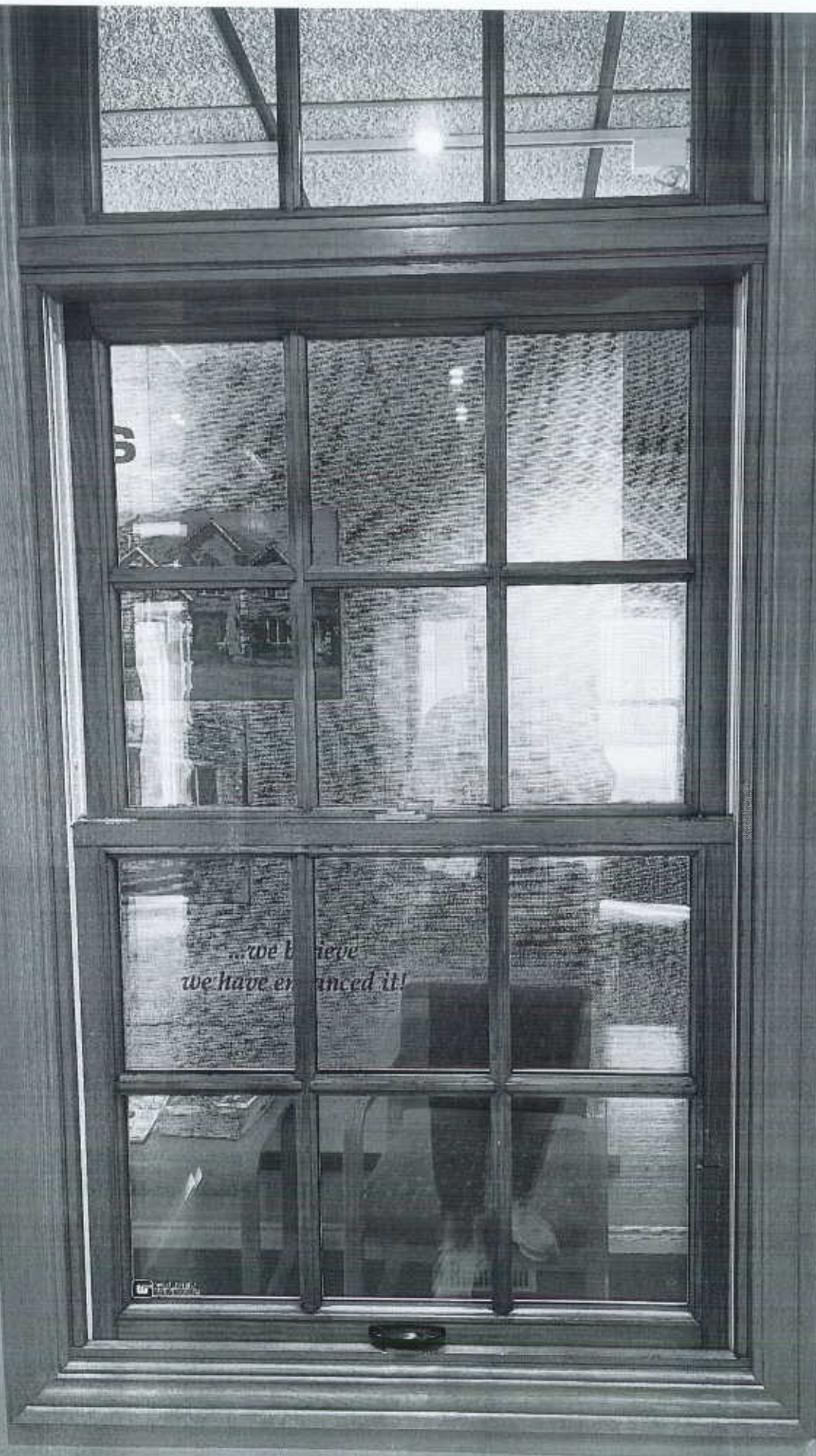
GOLDENCLAD DOUBLE HUNG WITH TRANSCOM

FEATURES ...we believe we have enhanced it!