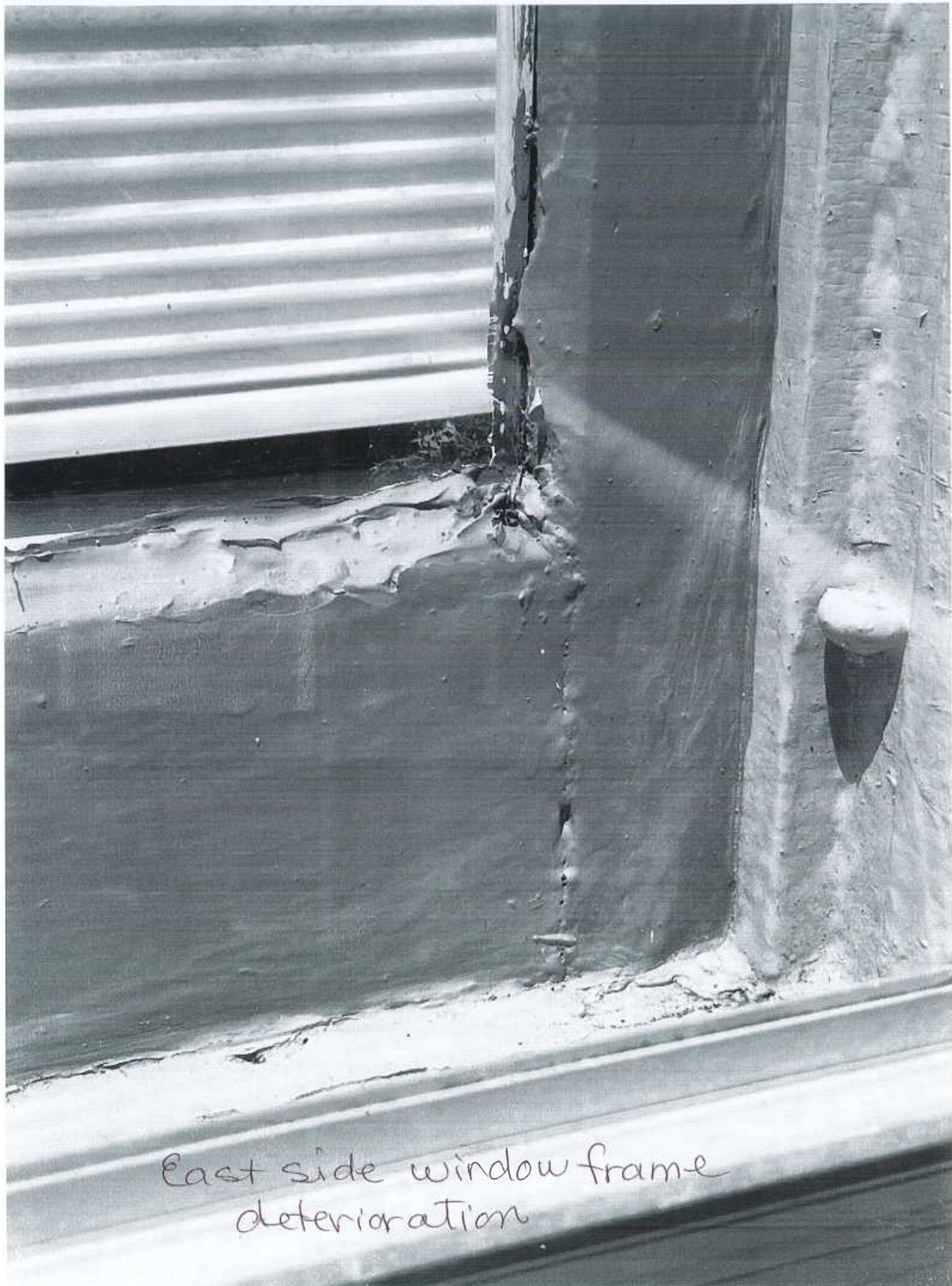
East side window frame deterioration