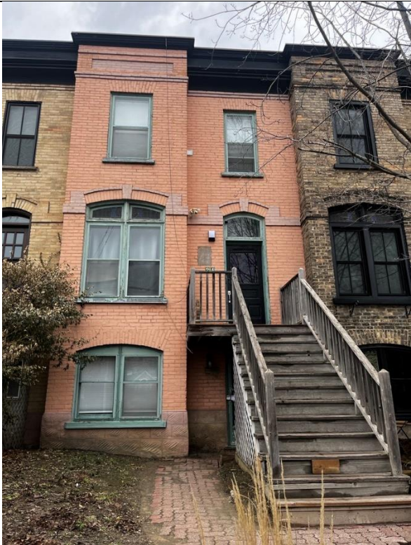
Front Façade of 24 Courtland Avenue East