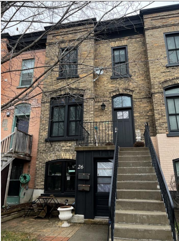
Front Façade of 26 Courtland Avenue East