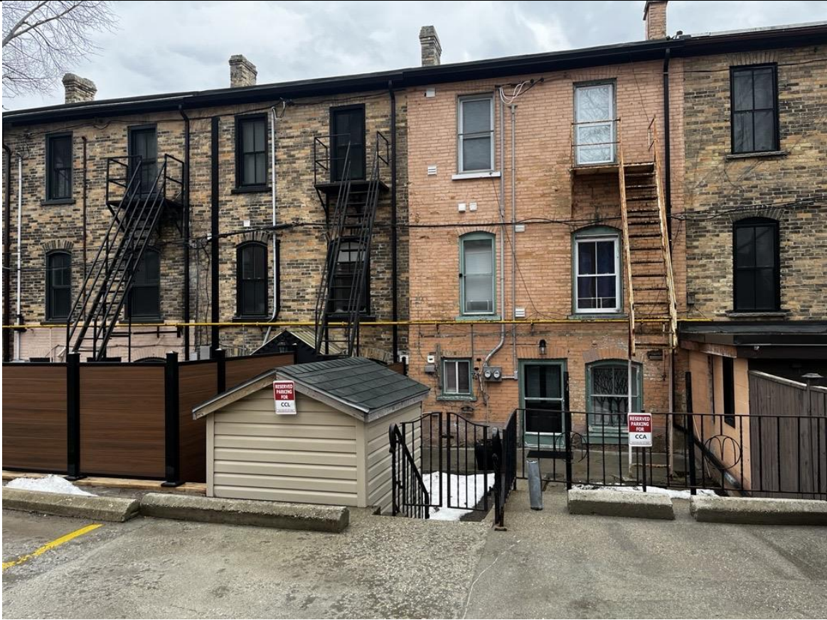
Rear Façade of 26 Courtland Avenue East