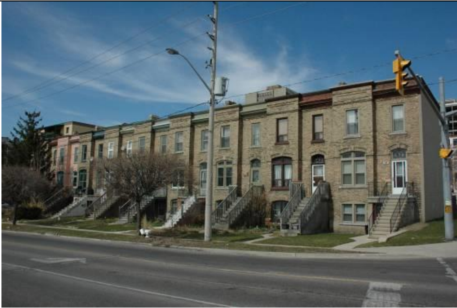
26 Courtland Avenue East – Entire Nelson Terrace Row House Building