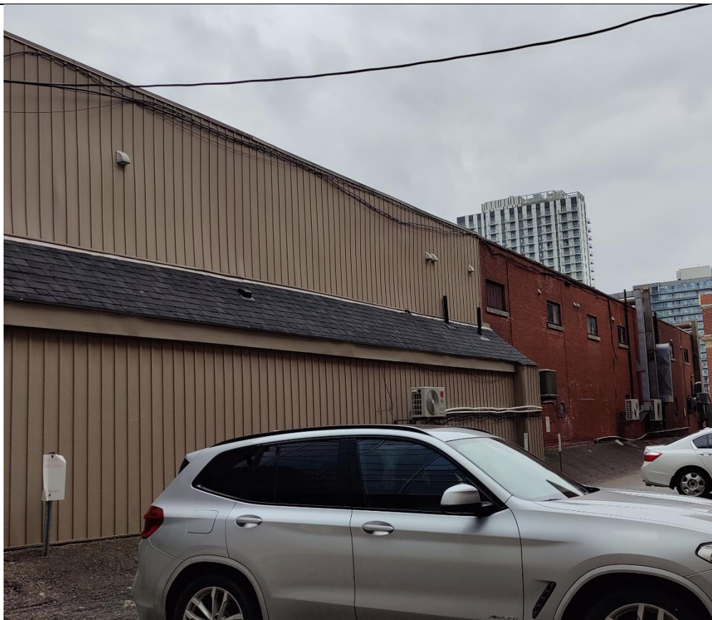
Rear Elevation (North Façade)