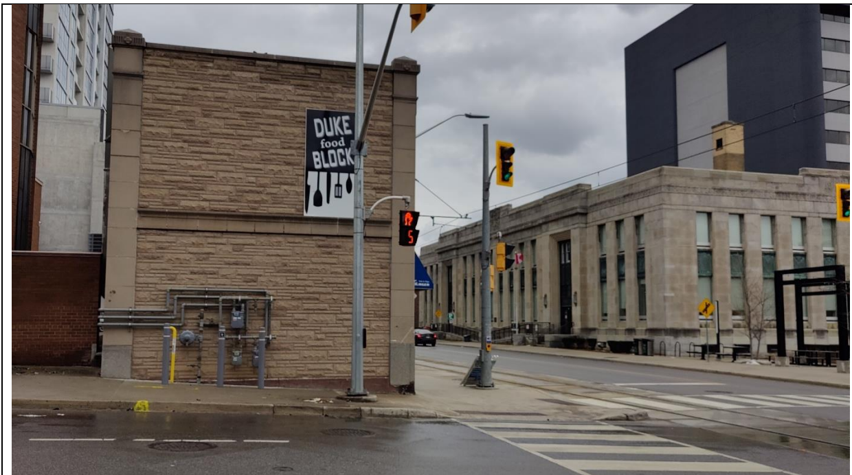
Side Elevation (West Façade)