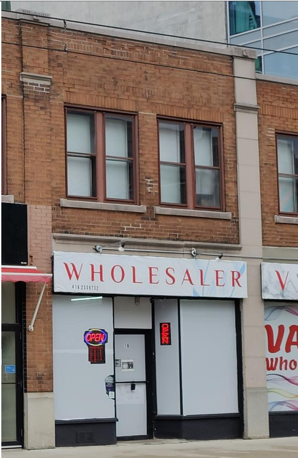
Close up of one bay displaying the different pilasters and decorative brickwork above the second-storey windows