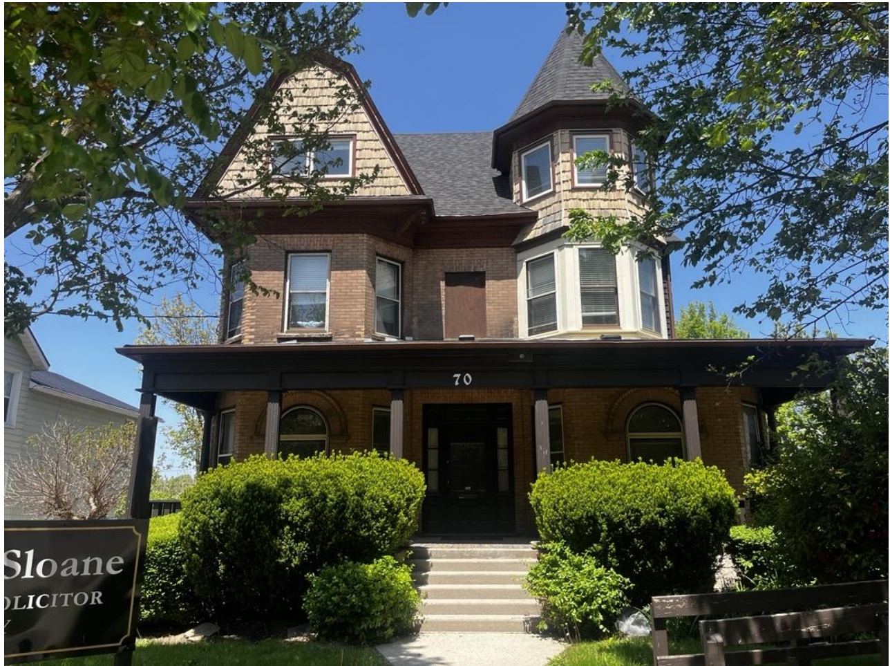
Figure 2: Front Facade of Subject Property

Identifying and protecting cultural heritage resources within the City of Kitchener is an important part of planning for the future, and helping to guide change while conserving the buildings, structures, and landscapes that give the City of Kitchener its unique identity. The City plays a critical role in the conservation of cultural heritage resources. The designation of property under the Ontario Heritage Act is the main tool to provide long-term protection of cultural heritage resources for future generations. Designation recognizes the importance of a property to the local community; protects the property's cultural heritage value; encourages good stewardship and conservation; and promotes knowledge and understanding about the property. Designation not only publicly recognizes and promotes awareness, but it also provides a process for ensuring that changes to a property are appropriately managed and that these changes respect the property's cultural heritage value and interest.