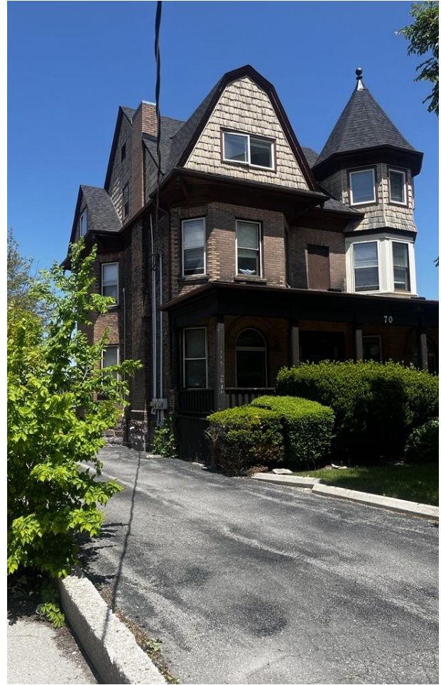
Figure 3-4: Side Facades of Subject Property

70 Francis Street North is recognized for its design/physical, historical/associative, and contextual value. It satisfies five of the nine criteria for designation under Ontario Regulation 9/06 (amended by Ontario Regulation 569/22). A summary of the criteria that is met or not met is provided in the table below.