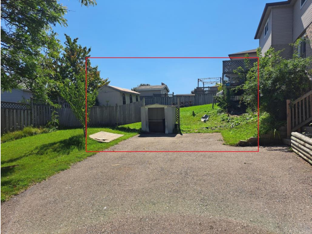
Figure B – Location of Proposed ADU (Detached)