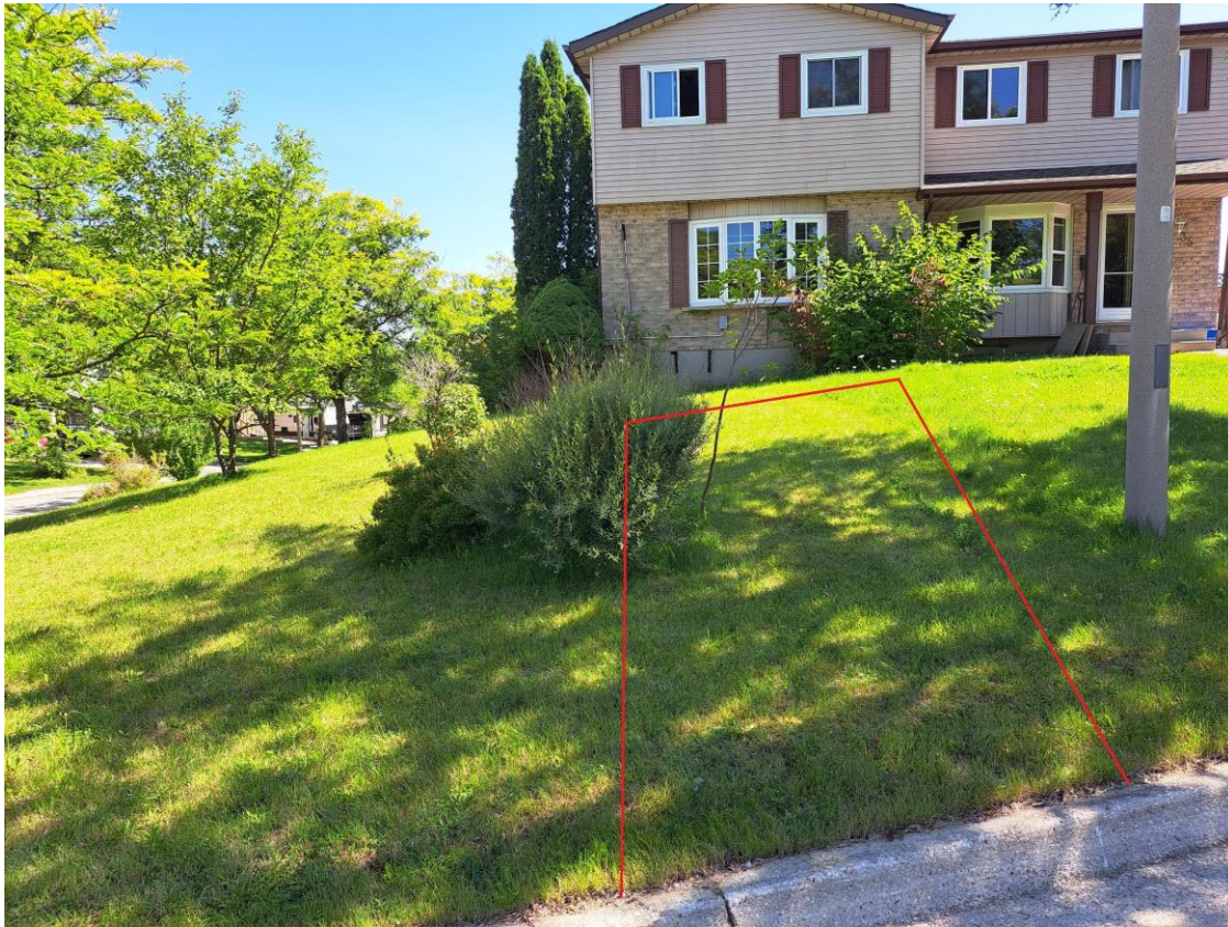
Figure C - Location of Proposed Driveway