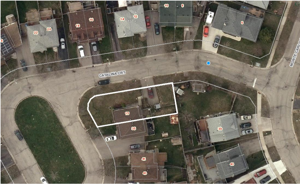
Figure A – Location of Subject Property

The subject property is located on Catalina Court, near its intersection with Monte Carlo Street. The existing use of the property is a semi-detached dwelling unit.