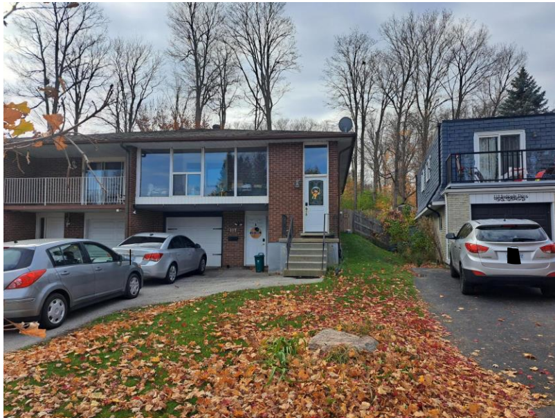
Figure 2 – Subject Property