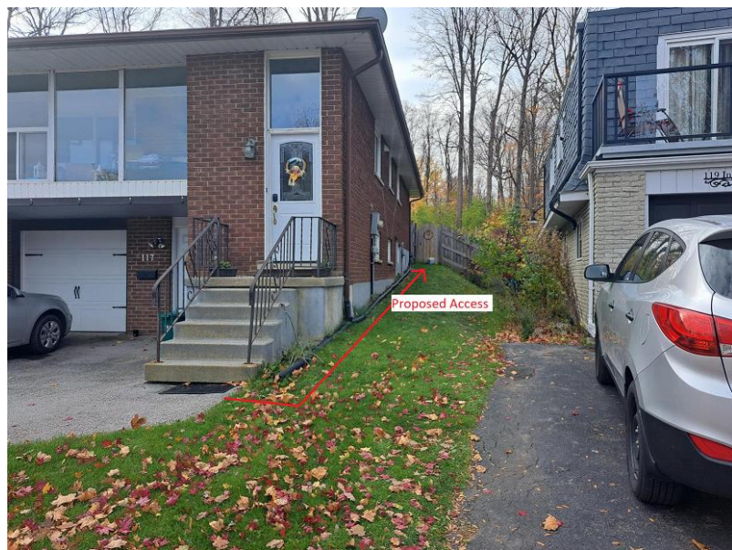
Figure 3 – Proposed Access