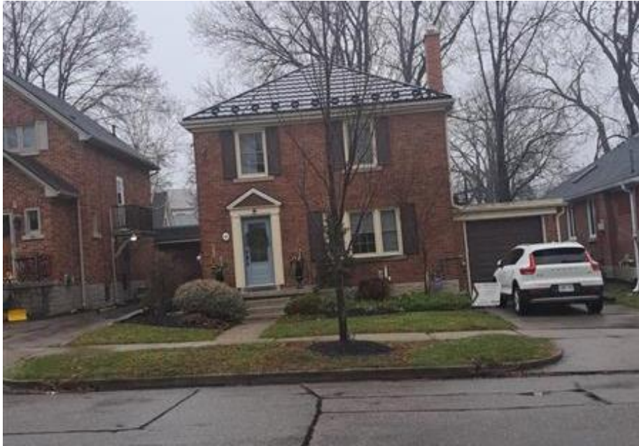
Figure 2: Front view of the existing property