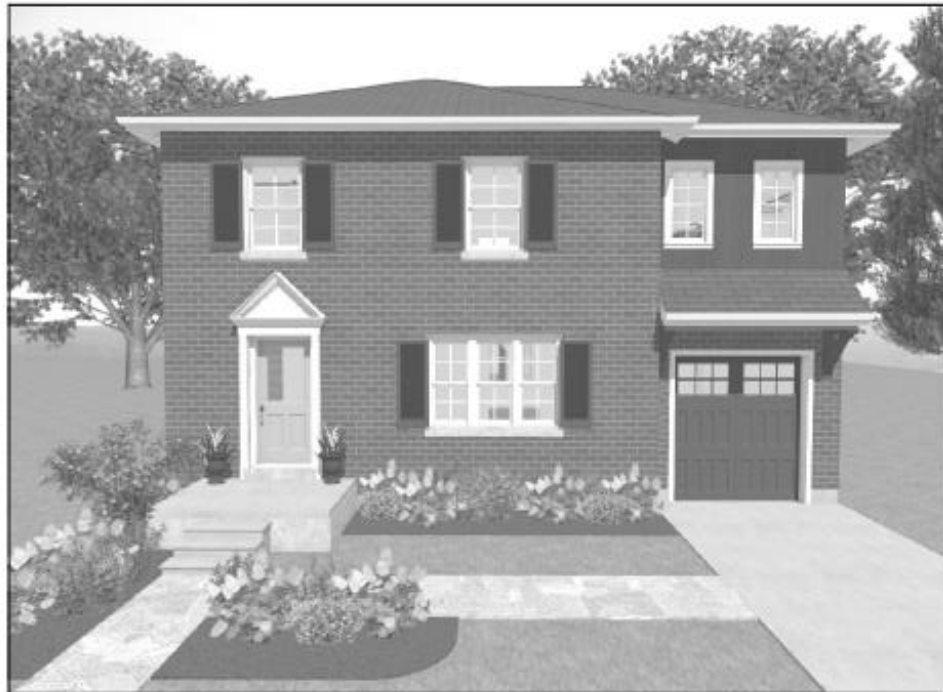
PROPOSED ADDITION: FRONT