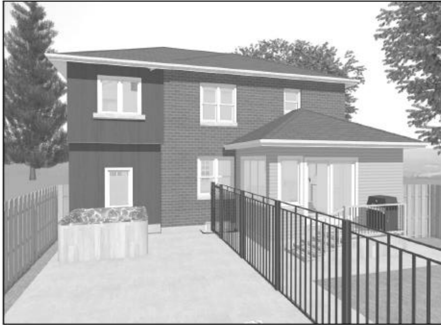
PROPOSED ADDITION: REAR