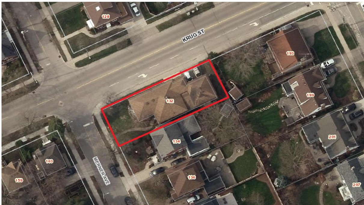
Figure 1: Subject property – 132 Merner Avenue

The subject property is located at the corner of Merner Avenue and Krug Street. The subject lands are surrounded by low rise residential uses.