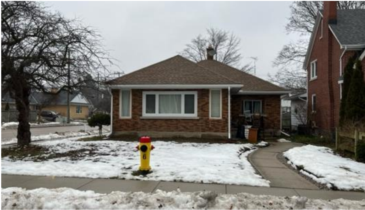
Figure 4: Front view of 132 Merner Avenue