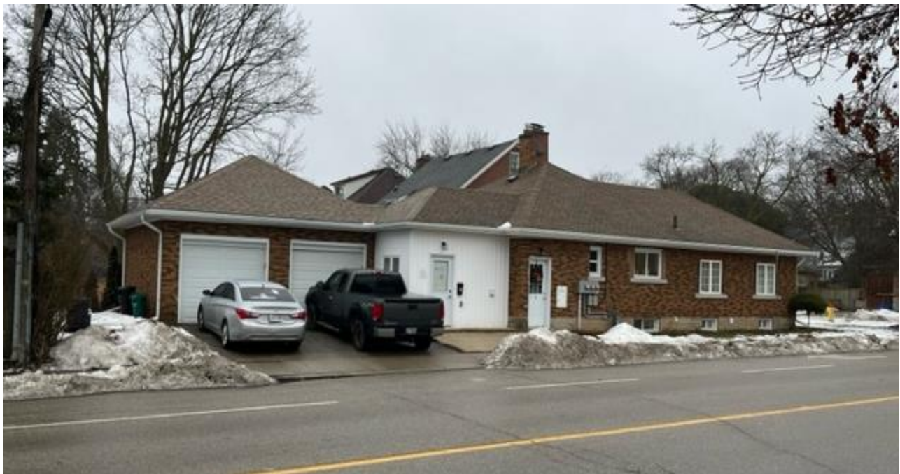
Figure 3: Side view of 132 Merner Avenue (Krug Street Side)