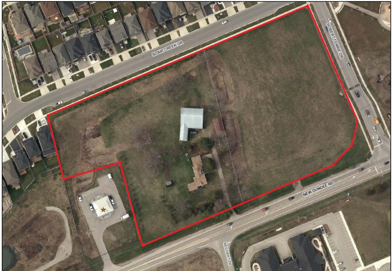
Figure 1: Location of Subject Property

The subject property is located at the northwest intersection of New Dundee Road and Robert Ferrie Drive. The site has frontage on the north side to Blair Creek Drive. The subject lands currently contain a single detached dwelling and two structures previously used for agricultural operations.