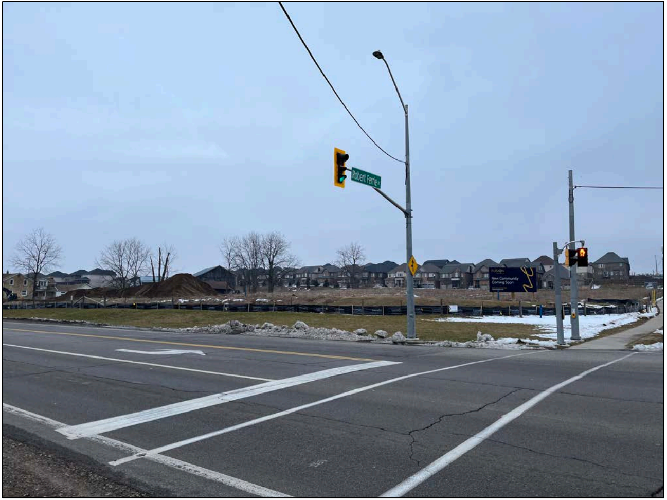
Figure 2: View of Subject Lands, Intersection of New Dundee Road and Robert Ferrie Drive (January 31, 2024)

The purpose of the application is to facilitate the redevelopment of the lands with a townhouse development containing 210 units within eleven (11) buildings. The existing single detached dwelling (heritage building) is proposed be relocated on site, bringing the total amount of units to 211. Site Plan Application SP23/053/N/ES was granted Conditional Approval on September 22, 2023. Heritage Permit HPA-2023-IV-30 is currently under review.