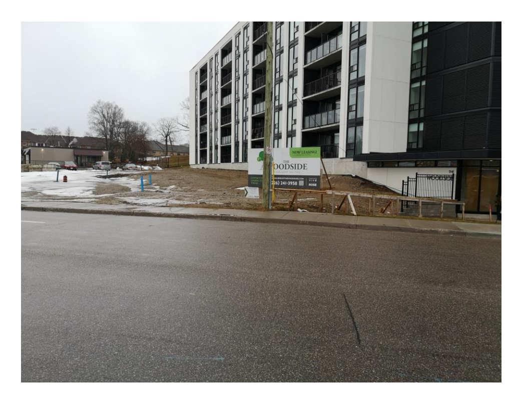
Figure 1 – Photo of subject lands – February 2, 2024.