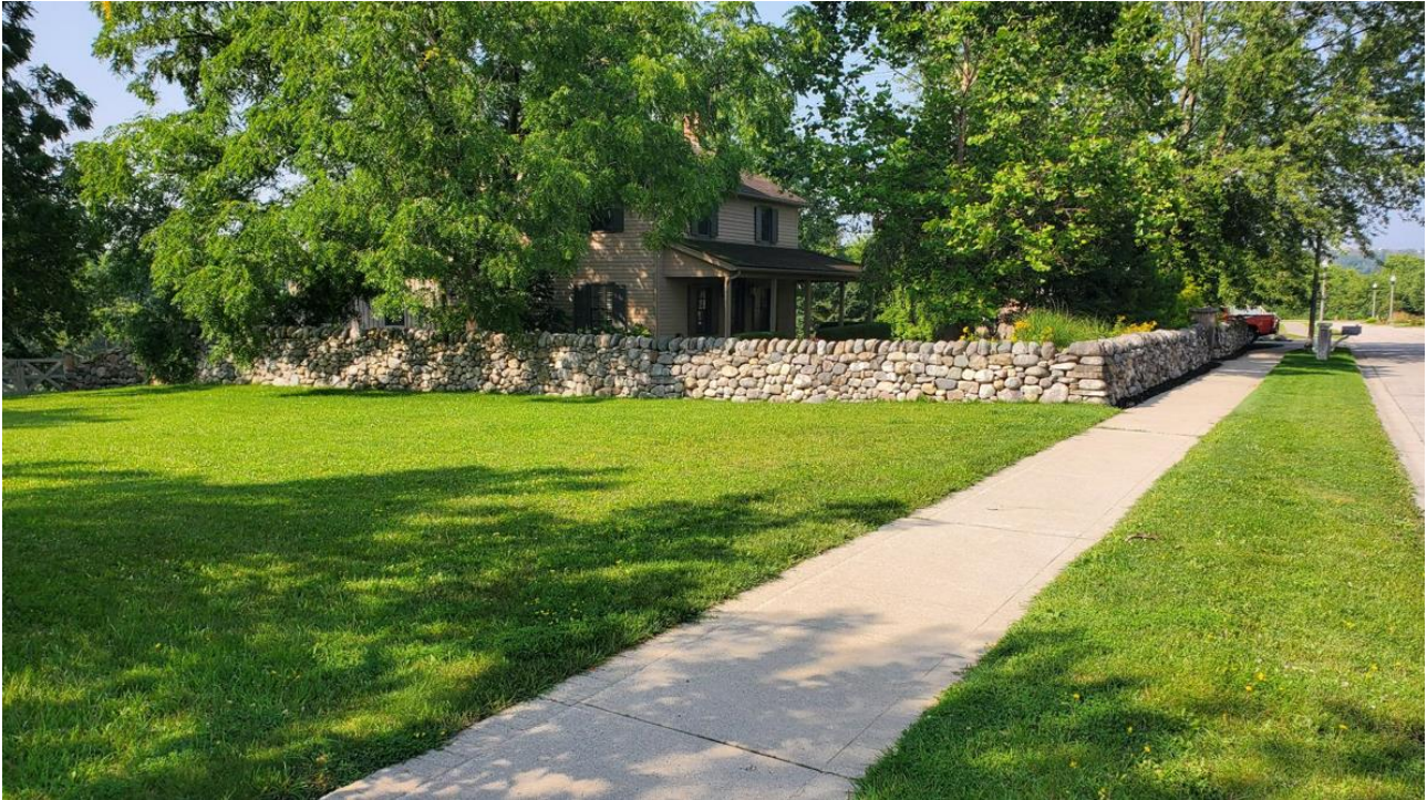
Figure 7: East Side View of Rear of Property from the Sidewalk

As the property slopes, the proposed rear addition will be located below the ground-floor of the original farmhouse. The topography, in addition to the location of the addition at the rear of the existing home, will mean that it will not be visible from the street ( Figures 6-7 ). Further, as the new addition is proposed to extend from an existing addition, the potential for impacts to the original farmhouse itself is extremely limited.