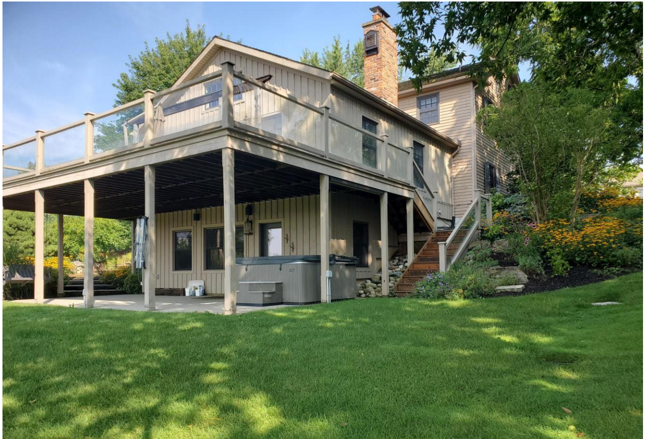
Figure 3: Existing Rear Deck and Patio

At present there is an existing rear deck that extends from the ground floor of the farmhouse but, due to the sloped topography of the site, is located above-grade. The deck is comprised of Trex composite decking and has a wood and glass guard rail. A concrete-slab patio space is located beneath this deck.