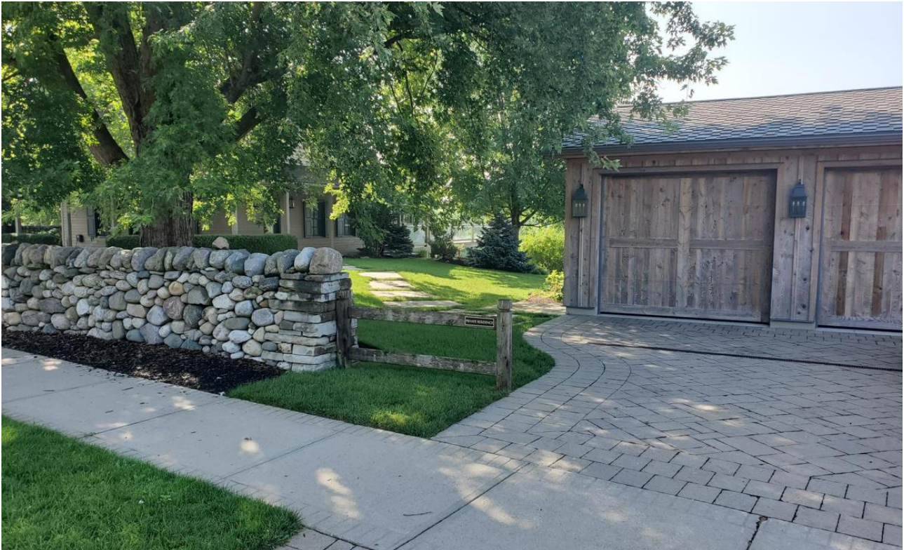
Figure 8: West Side View of Rear of Property from the Sidewalk