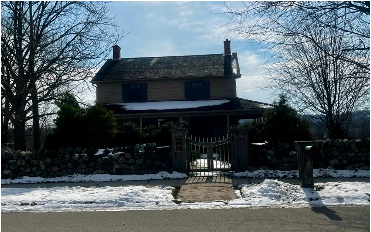
Figure 2: Front Façade of Subject Property

300 Joseph Schoerg Crescent is designated under Part IV of the Ontario Heritage Act by way of Designating By-law 2003-179, and is recognized for its design/physical, historical/associative, and contextual values. The property is identified as being part of the earliest inland non-native settlement of what would become Waterloo County. The existing farmhouse and driveshed structure is believed to have been constructed c.1830 by John Betzner, a member of one of Waterloo County's founding families. Architecturally the original farmhouse is a representative and early example of the Mennonite Georgian architectural style. The landscape of the property is of historical significance as well, as it includes views to the Grand River (designated a Canadian Heritage River) and still contains many of the features which originally influenced settlement in the area. Identified attributes of significance on the farmhouse include: