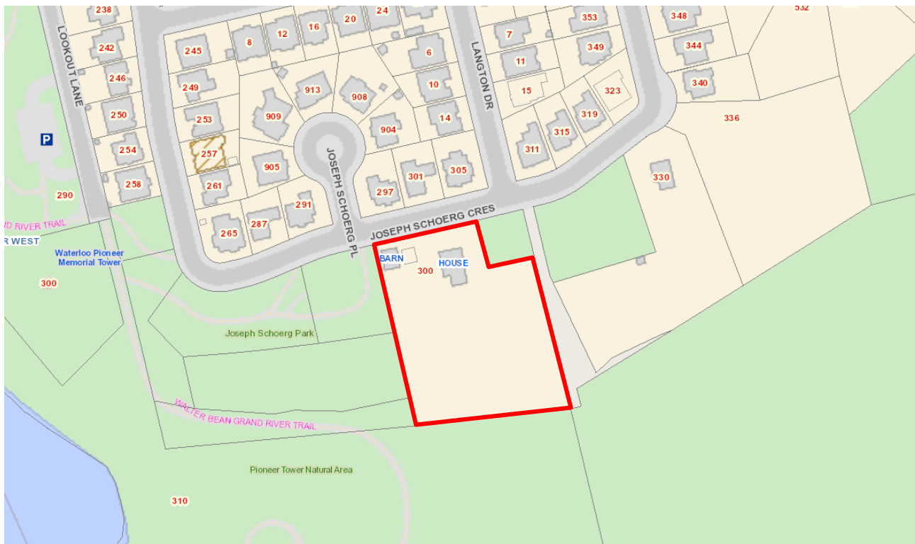
Figure 1: Location Map of Subject Property

The Development Services Department is in receipt of Heritage Permit Application HPA-2024-IV-003, which seeks permission for the demolition of an existing rear deck and concrete slab to facilitate the construction of a one-storey addition on the property municipally addressed as 300 Joseph Schoerg Crescent, formerly addressed as 437 Pioneer Tower Road.