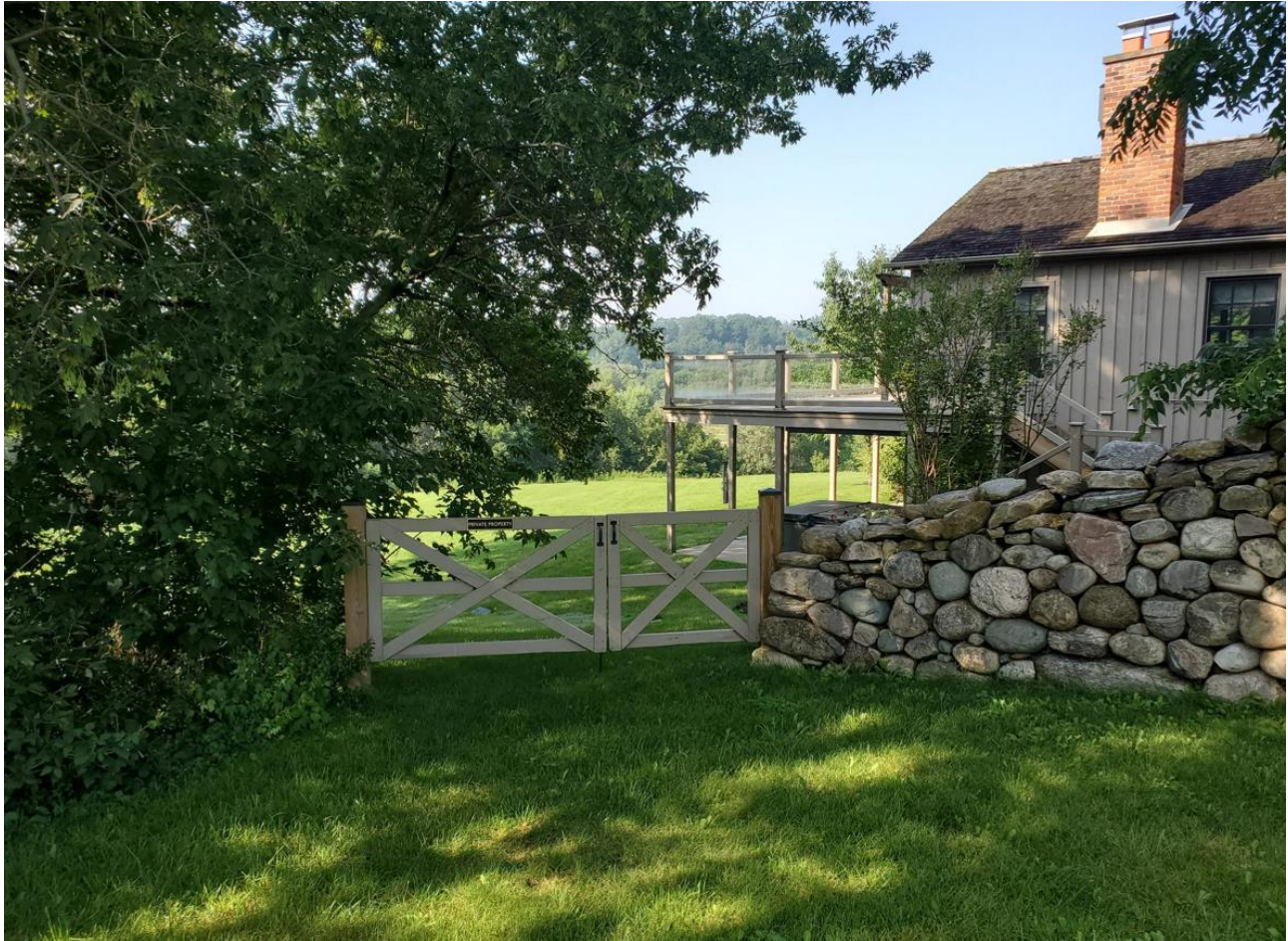
Figure 9: View of Rear of Property from City Land

The new addition will be visible should one approach the gate that leads from the adjacent City-owned property to the subject property ( Figure 8 ). Currently from this vantage point the Grand River can be viewed through the existing deck; while the addition will block this view the applicant is proposing that the vegetation next to the east side of the gate be trimmed back so that the Grand River is visible from a slightly different angle. It should be noted that, while this view is identified in the Statement of Significance, it is not in itself identified as a heritage attribute within Designing By-law 2003-179.