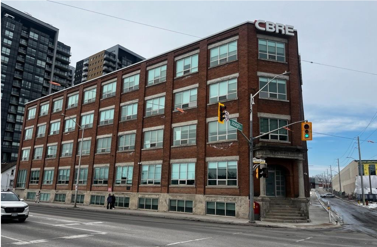
Figure 2: Front Facade of 2-22 Duke Street East

Identifying and protecting cultural heritage resources within the City of Kitchener is an important part of planning for the future, and helping to guide change while conserving the buildings, structures, and landscapes that give the City of Kitchener its unique identity. The City plays a critical role in the conservation of cultural heritage resources. The designation of property under the Ontario Heritage Act is the main tool to provide long-term protection of cultural heritage resources for future generations. Designation recognizes the importance of a property to the local community; protects the property’s cultural heritage value; encourages good stewardship and conservation; and promotes knowledge and understanding about the property. Designation not only publicly recognizes and promotes awareness, but it also provides a process for ensuring that changes to a property are appropriately managed and that these changes respect the property’s cultural heritage value and interest.