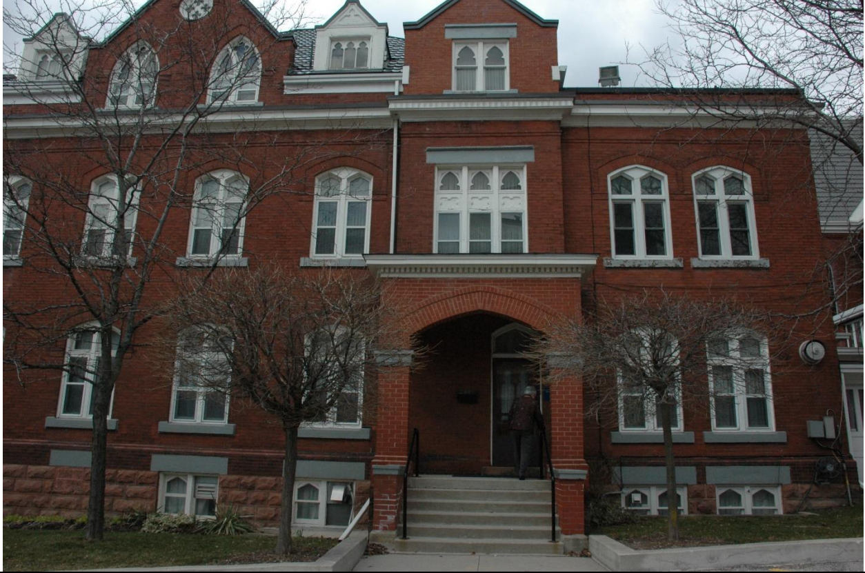
56 Duke Street West