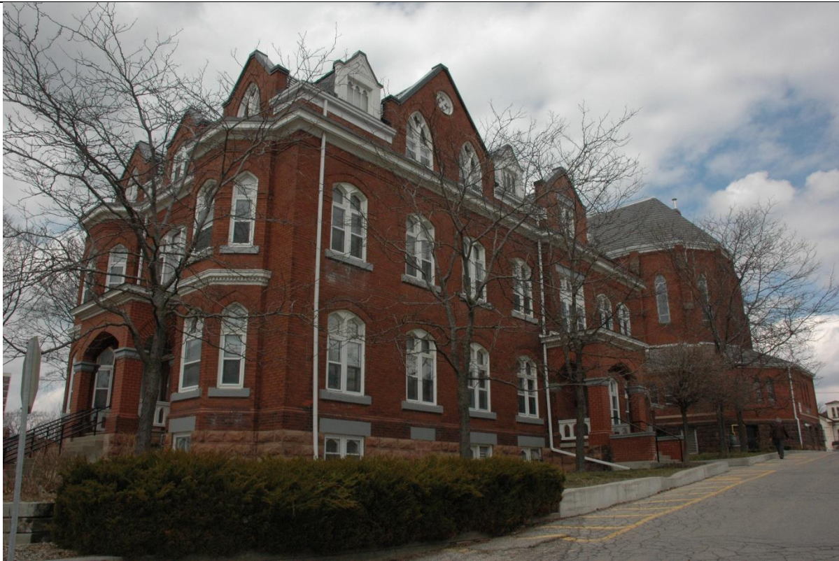
56 Duke Street West