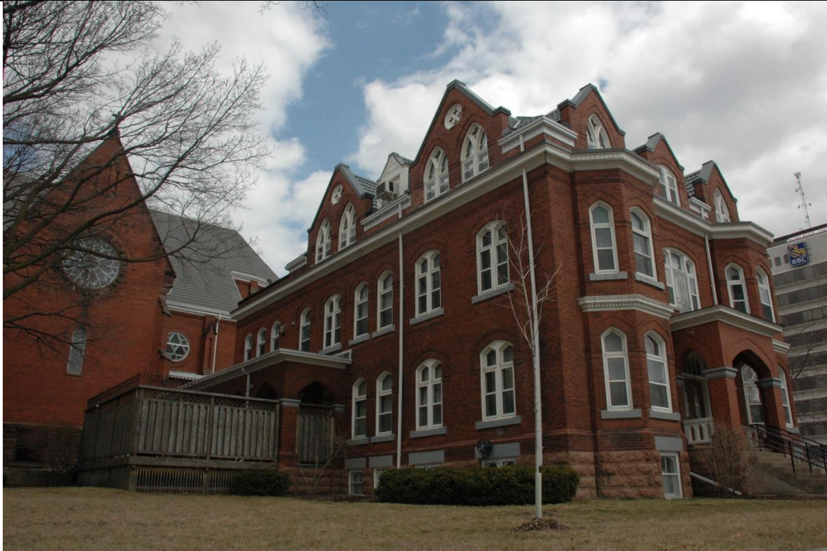
56 Duke Street West