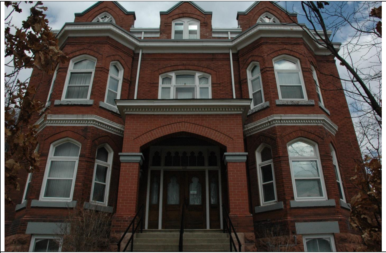
56 Duke Street West