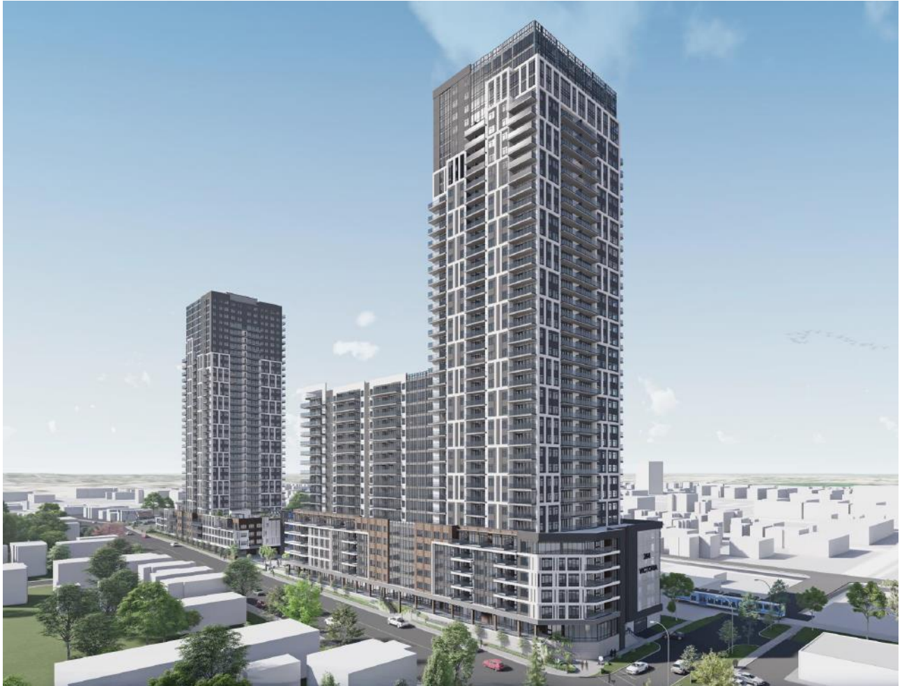
Figure 2: Rendering of Proposed Development - View from Victoria & St Leger Street

As of the date of this report, 236 Victoria Street North contains a three-storey commercial building and surface parking lot. 264 contains a three-storey fitness facility and a surface parking lot. Neither of the subject properties have status under the Ontario Heritage Act , and both were reviewed in 2005 for the Heritage Kitchener Inventory and determined to have no heritage value or significance. The subject lands are, however, located within the Warehouse District Cultural Heritage Landscape (CHL) as per the Cultural Heritage Landscape Study completed in 2014 and approved by Council in 2015. The subject lands are also adjacent to identified heritage resources, including: