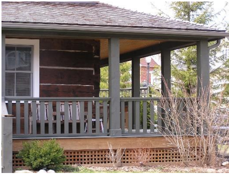
Detail of first storey covered verandah with cedar shingle roof, pine posts and pine railings