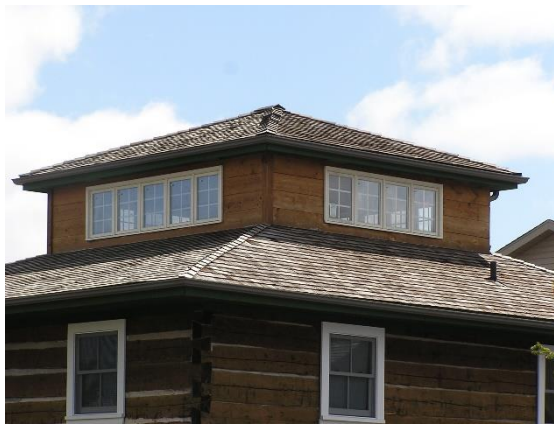
Detail of the pyramidal cedar shingle roof, pine fascia and frieze and glass roof lantern with prefinished metal covered wood windows with muntins