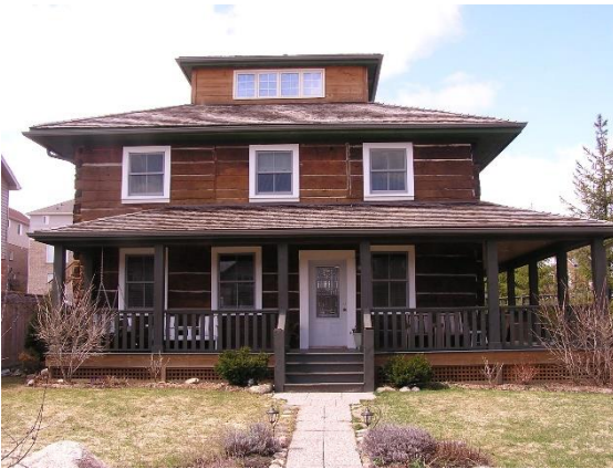
Front Elevation (East Façade)