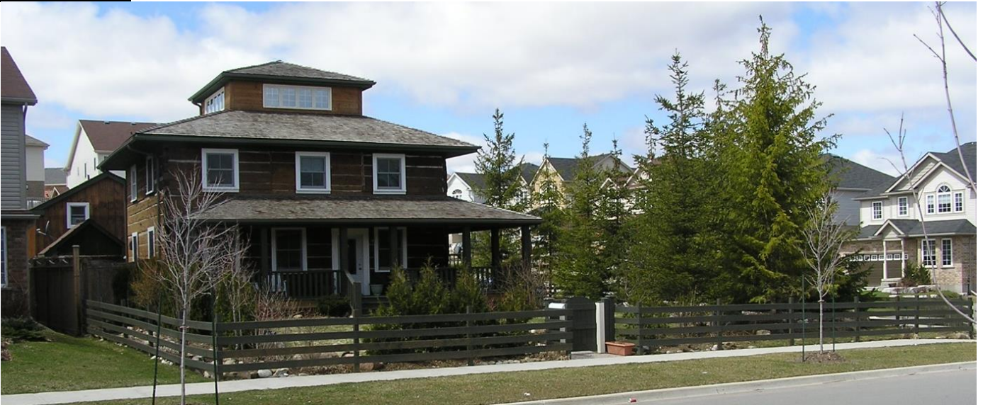
Context: Front Elevation (East Façade) of 7 Fischer Court located on a corner lot within a suburban subdivision