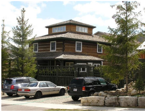
Side Elevation (North Façade) & Rear Elevation (West Façade)