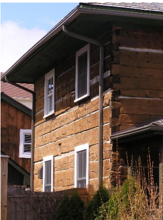
Side Elevation (South Façade)